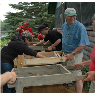
Volunteers at the Wigwam site on the upper Machias River.