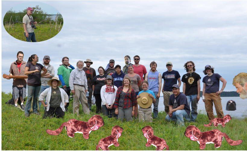
Field school students in Machias, with the addition of guest excavators and speakers (by photoshop). This was the year of the Sea Mink, to explain the stuffed four-footed guests.