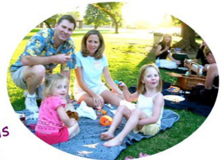
Hiking Trails and Low Ropes Course

Sign up for the morning (10am-12noon) or afternoon (1pm-3pm) session