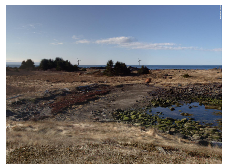
Fig. 1. Visualization seen by respondents.