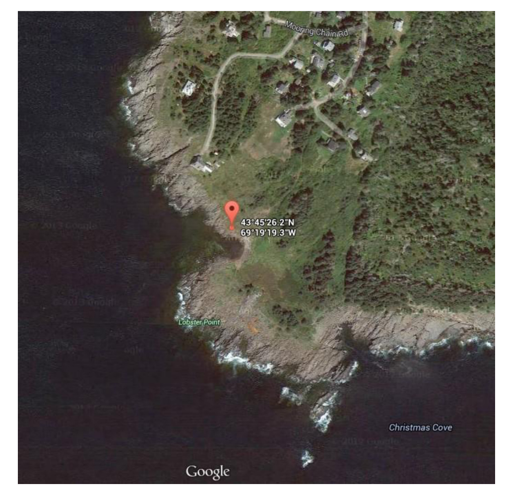
Fig. 2. Aerial view and coordinates of vantage location.