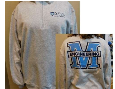
Gray Quarter Zip Sweatshirt