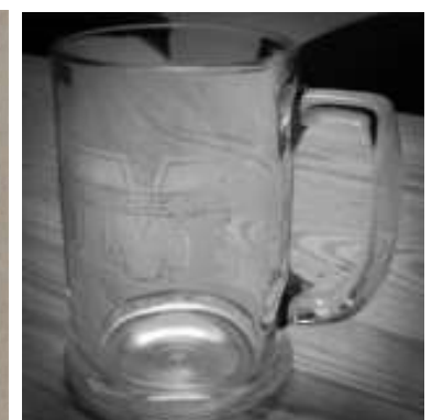
Frosted Engineering Stein