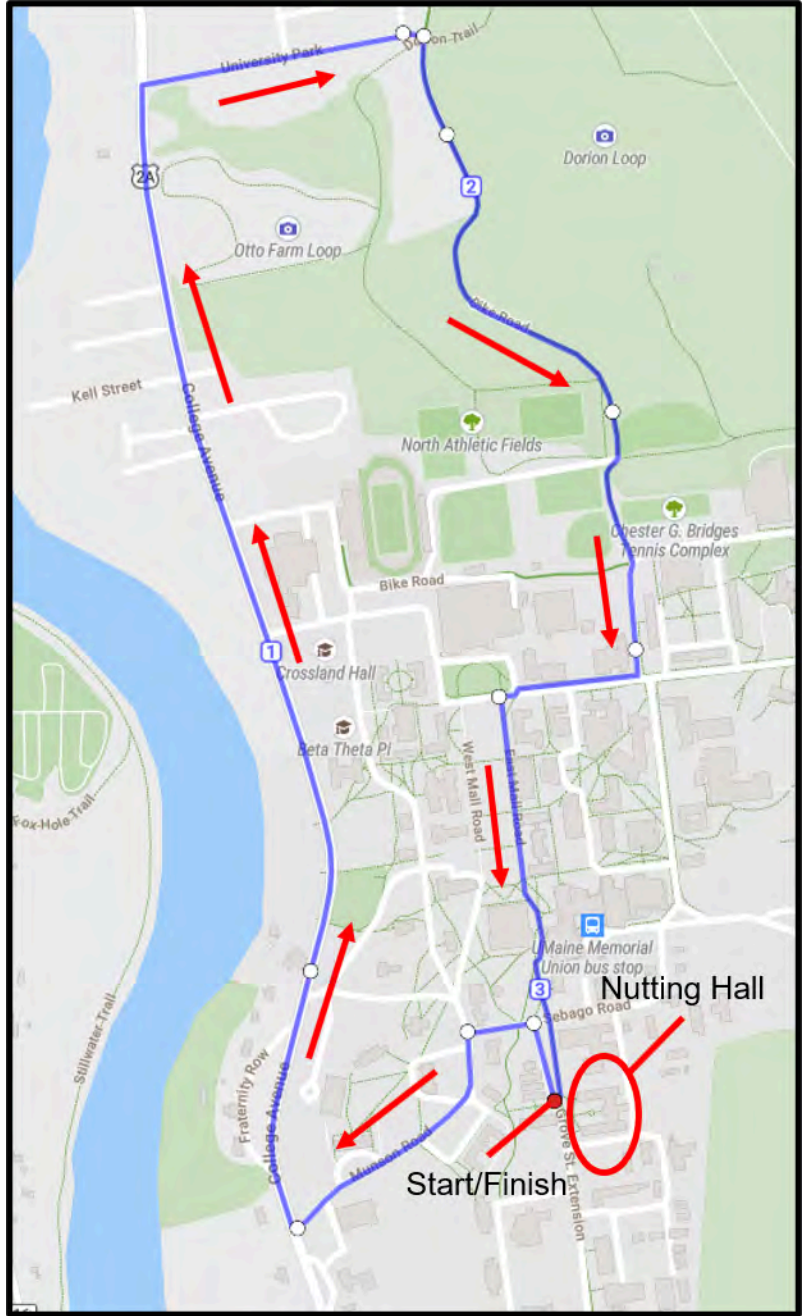
Official Course of the Spawning Run.