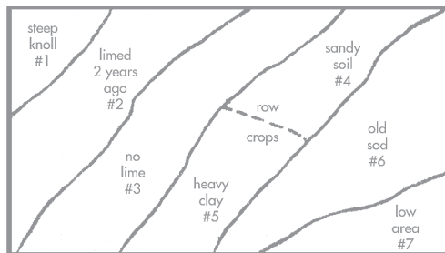
EXAMPLE 50 ACRE AREA

Low spots, trouble spots, and areas with obvious differences in soil type should be treated as separate sampling areas. Also, areas that have been treated differently in the past should be sampled separately. In areas where past treatments and soil types are uniform, limit the sampling area to 8 acres in size. Make a permanent field sampling map for your reference when test results are returned.