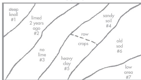
EXAMPLE 50 ACRE AREA

Low spots, trouble spots, and areas with obvious differences in soil type should be treated as separate sampling areas. Also, areas that have been treated differently in the past should be sampled separately. In areas where past treatments and soil types are uniform, limit the sampling area to 8 acres in size. Make a permanent field sampling map for your reference when test results are returned.