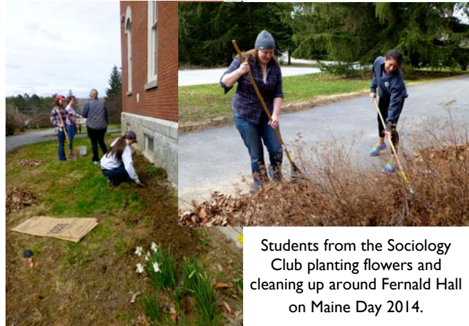
Students from the Sociology Club planting flowers and cleaning up around Fernald Hall on Maine Day 2014.

Aside from being involved in the everyday activities of RJP and serving as a conference facilitator, I had the opportunity to present research and data on the restorative process at the Center for Undergraduate Research (CUGR) Academic Showcase in April. The CUGR showcase is a great experience because you have the chance to show the academic community, and anyone else who shows up, what research you've done and you have the chance to see what other students in different disciplines have been doing. Participating in the showcase and speaking about RJP and their research has also provided me with a an opportunity to practice for presenting at the ASA Honors Program, held in San Francisco this August. I will be traveling there with