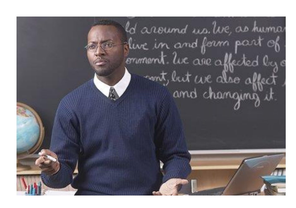
and men professors.