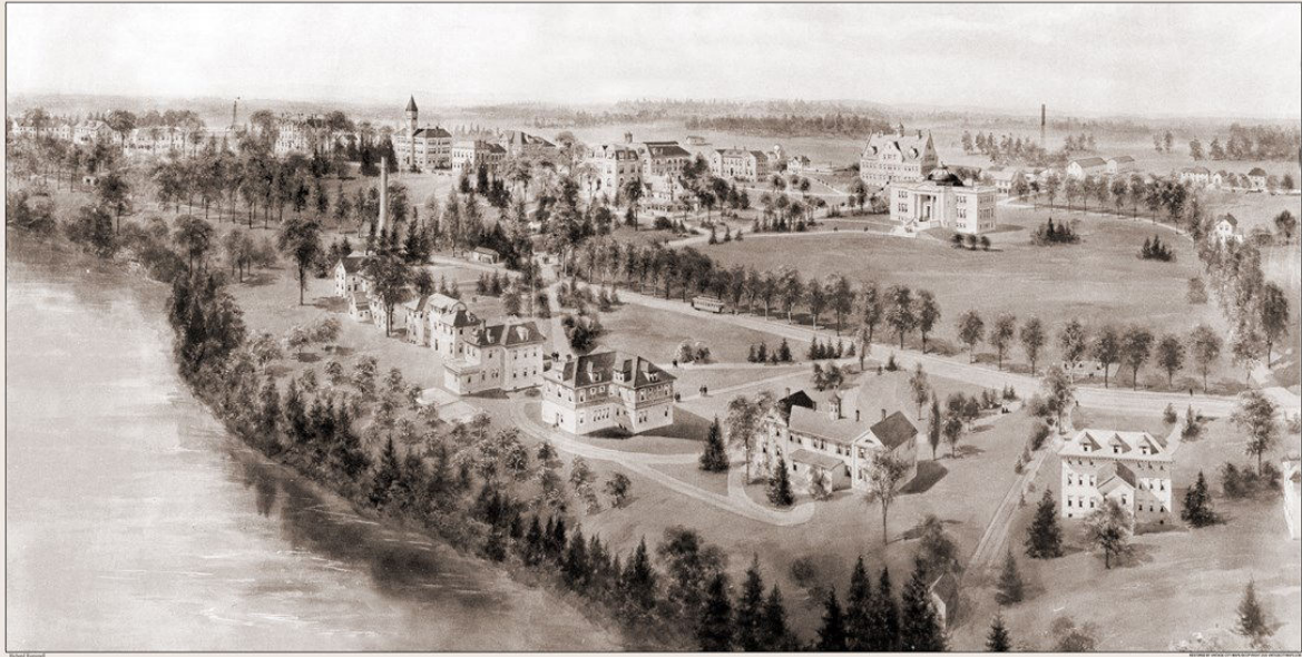
UNIVERSITY OF MAINE ORONO 1912