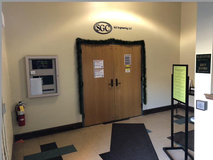
3. Front entrance