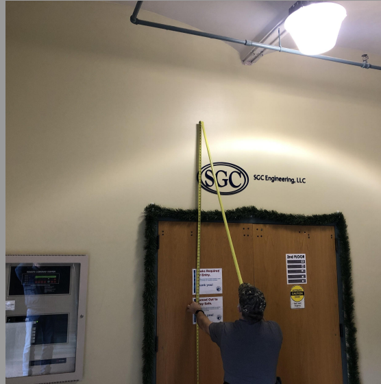
6. Door Height