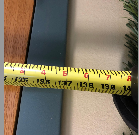
7. Door frame