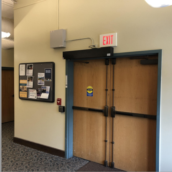
8. Reverse side of entrance door