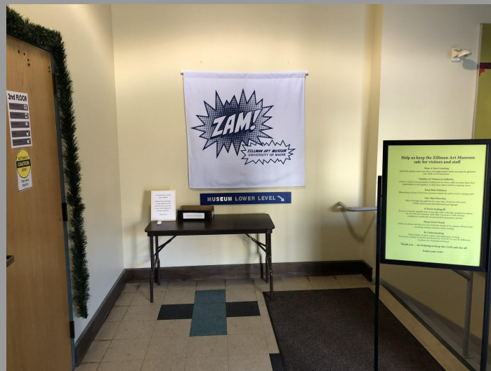
4. Front entrance