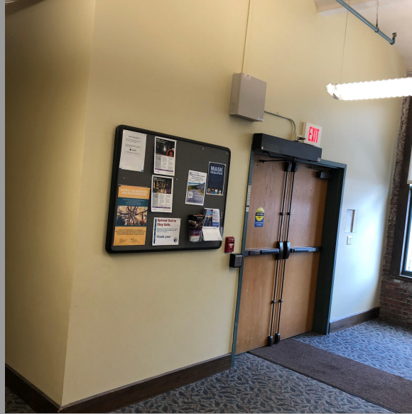
9. Reverse side of entrance door