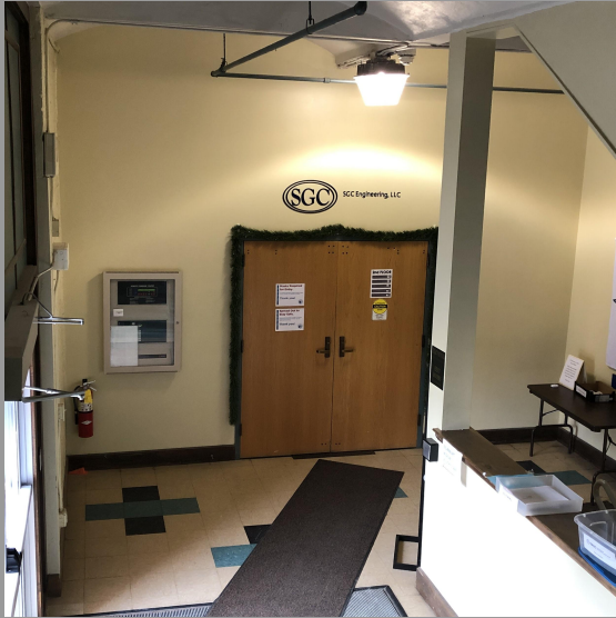
5. Front entrance