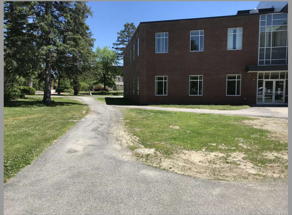
4. View looking towards SMH 8 away from SMH 6a