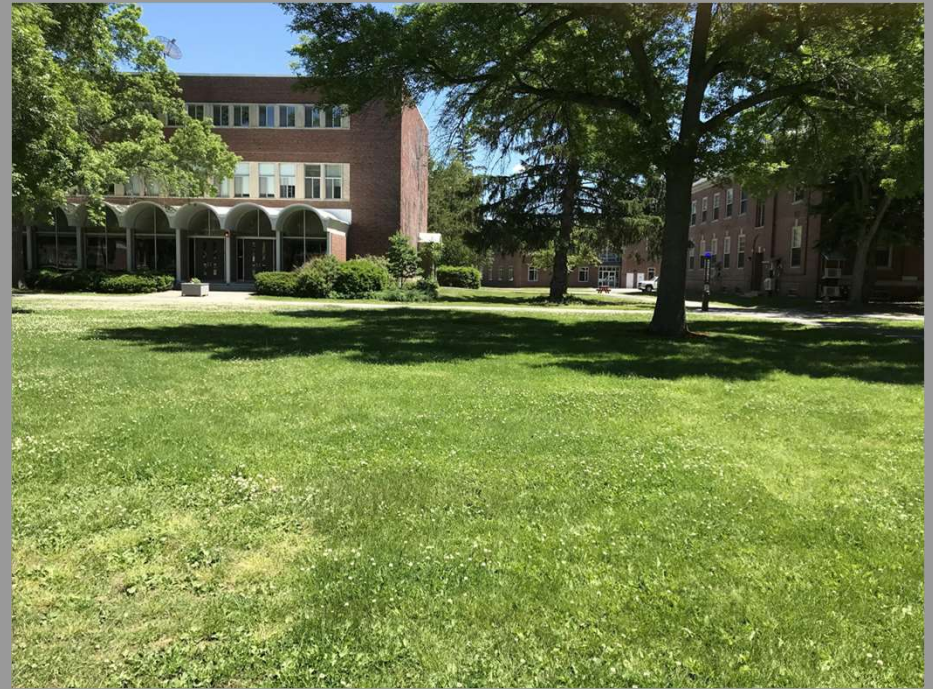
6. View from proposed SMH 6a looking towards SMH 7