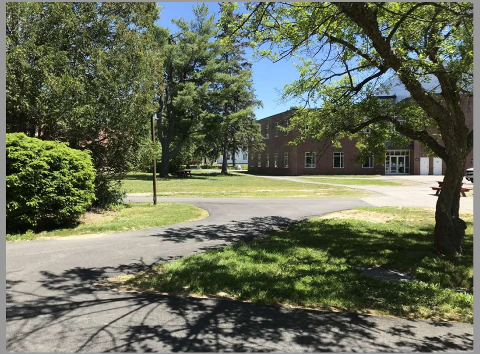
6. View looking towards SMH 8 near far building; SMH 7 near bush on left