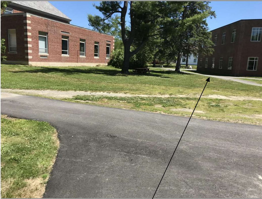
5. View looking towards SMH 8; SMH 7 on left out of frame