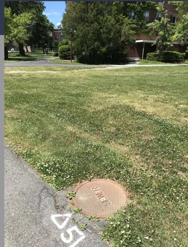
2. At SMH 8 looking to SMH 7