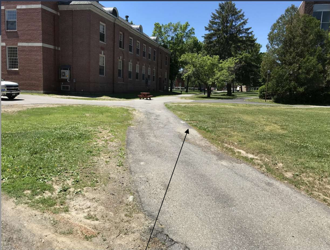
1. View looking at SMH 8 towards SMH 7