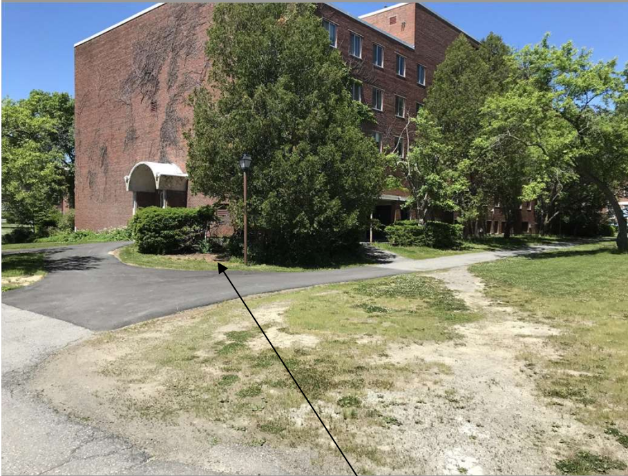
3. View looking towards SMH 7 near building corner.