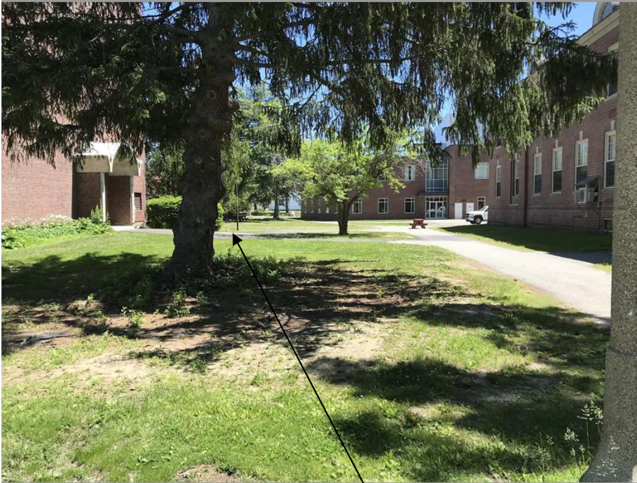
5. View looking towards SMH 7 and SMH 8