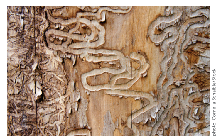
Stakeholders are uniting to fight the devastating emerald ash borer as it moves east toward Maine, devouring trees

time, they use Wabanaki diplomacy to call attention to the sovereignty of everyone involved and work to fashion a cooperative approach to problem solving.