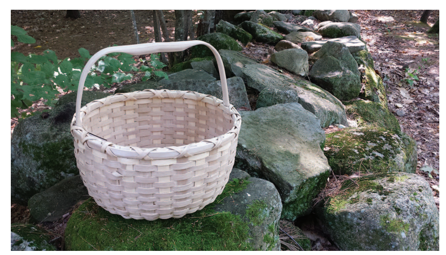
Figure 1. Black ash basket. Black ash baskets take many shapes and forms, from sturdy pack baskets to decorative, fancy baskets. Other baskets mix utility with decoration. In Maine potato baskets are common, including this basket by Richard Silliboy of the Houlton Band of Micmacs.