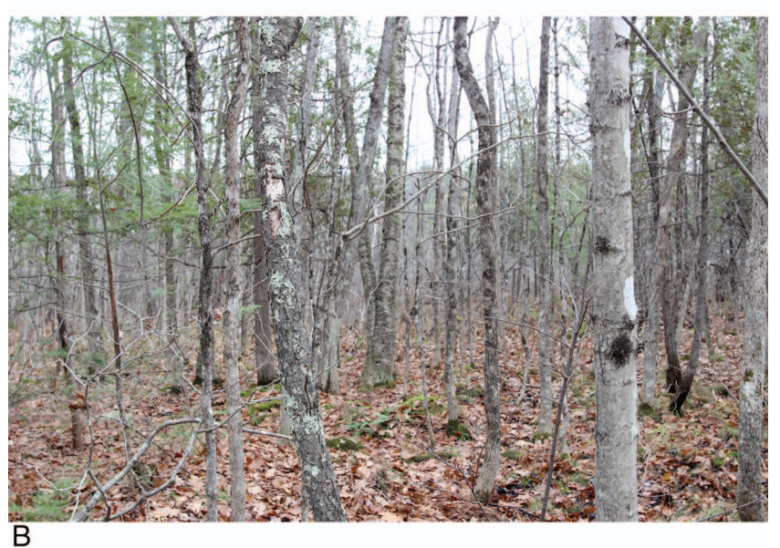
Figure 6. Site 4: black ash swamp. Site 4 is a moderate to highly dense black ash stand. The edge of the stand grades into a lake. The site is characterized by mucky, saturated soils (A) nearly year-round. Most black ash are small, with very few trees >6 in. dbh. Trees frequently have sweeping stems, epicormic branching, and root buttressing (B). Black ash >4 in. dbh are poor quality, with very narrow annual growth (B).

of increased deadwood inputs from EAB-induced mortality on hydrology and stand development. Site hydrology is also a critical factor in determining the quality of black ash trees, yet the impact of EAB-induced changes in hydrology on basket-quality ash have yet to be determined. To address these knowledge gaps, the establishment of long-term experimental and monitoring sites could help track succession and development, assess changes in the water table, quantify changes in basket-quality ash, and monitor for the arrival of EAB.