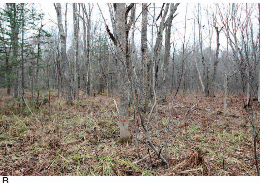
Figure 3. Site 1: hardwood river terrace. Site 1 is a sparse to moderately dense black ash, mixed hardwood stand. The stand is separated from a neighboring conifer stand by a small stream (A). The majority of black ash >4 in. dbh at this site are high quality (B).

during the Symposium, the black ash swamps had moderate conifer densities (primarily balsam fir), whereas the hardwood river terraces were mixed hardwood stands composed of red maple, American basswood ( Tilia americana L.), green ash, and white ash ( Fraxinus americana L.). Harvesters and researchers both noted the improved quality of ash on the river terraces and often associated these basket-quality trees with the lack of conifers in/near the stand.