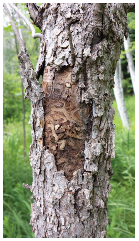
Figure 7. EAB infestation in a black ash tree. EAB can easily be identified by the distinctive S-shaped galleries from larvae feeding on xylem tissue. This black ash tree is infested with EAB, with clear galleries underneath the bark.

black ash is moderate or high. Black ash decline and mortality caused by EAB, however, may deplete root starch reserves, resulting in reduced frequency, vigor, or survivorship of vegetative growth. Furthermore, little is known about the quality of these sprouts regenerated from the stumps of basket-harvested trees. More work is needed in EAB-infested black ash stands, particu-