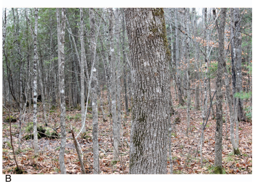
Figure 5. Site 3: hardwood river terrace. Site 3 is a moderately dense mixed hardwood stand with occasional conifer (A). A small stream runs northeast to southwest, and an unpaved road runs west to east through the stand. In better-drained areas, large, high-quality black ash are produced. Where ponding occurs, black ash tend to be smaller and poorer quality. The majority of black ash >4 in. dbh are high quality (B).

in high-value black ash stands. Such agreements can alleviate confusion and promote action as soon as EAB is detected in or near tribal lands or other traditional black ash harvesting sites. Furthermore, such agreements can help foster discussions on accessibility to black ash trees. To preserve the black ash resource and maintain black ash basketry in the face of EAB, discussions regarding accessibility and response plans need to occur.