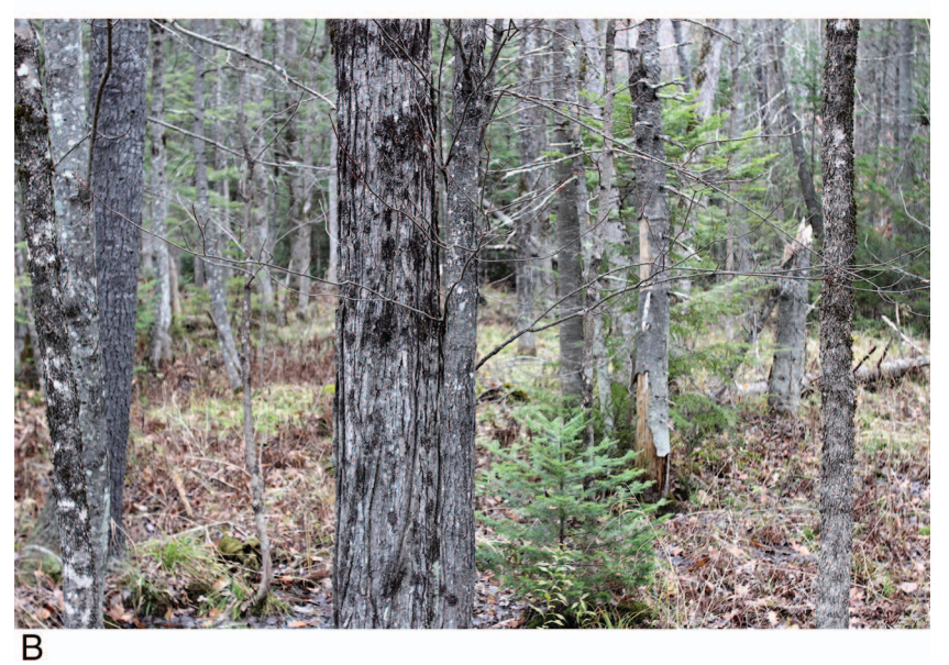
Figure 4. Site 2: black ash swamp. Site 2 is a moderately dense mixed hardwood-conifer stand with black ash, red maple, and balsam fir. The site is characterized by minimal ponding (A), root buttressing (A), and small black ash trees, typically <6 in. dbh (B). The majority of black ash >4 in. dbh are poor quality.

cates a greater abundance of black ash sprouts than seedlings in young age classes, in addition to higher mortality rates in sprouts. To fully understand how black ash sprouts may persist in EAB-infested stands, further investigation is needed on sprouting processes, the survivorship of black ash sprouts, the relationship to EAB population cycles, and the ability of these sprouts to become basket-quality trees.