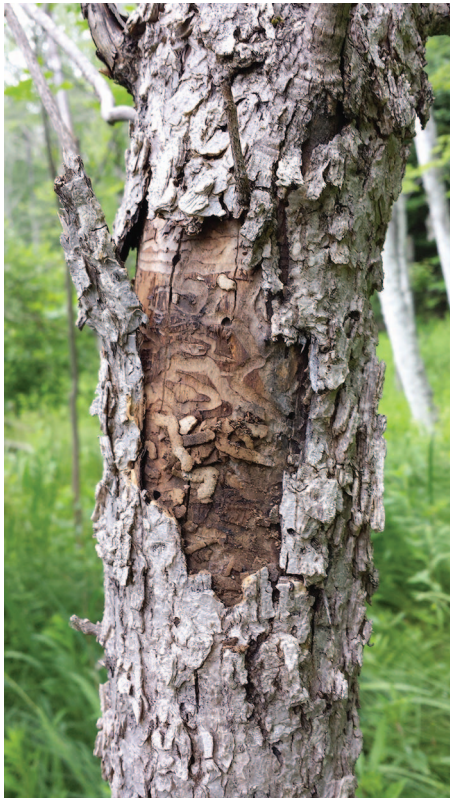
Figure 7. EAB infestation in a black ash tree. EAB can easily be identified by the distinctive S-shaped galleries from larvae feeding on xylem tissue. This black ash tree is infested with EAB, with clear galleries underneath the bark.