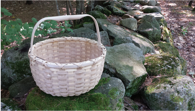
Figure 1. Black ash basket. Black ash baskets take many shapes and forms, from sturdy pack baskets to decorative, fancy baskets. Other baskets mix utility with decoration. In Maine potato baskets are common, including this basket by Richard Silliboy of the Houlton Band of Micmacs.