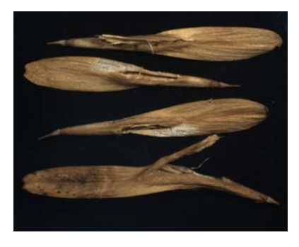
Empty seed due to insects. Rip in seed is due to insect exiting.