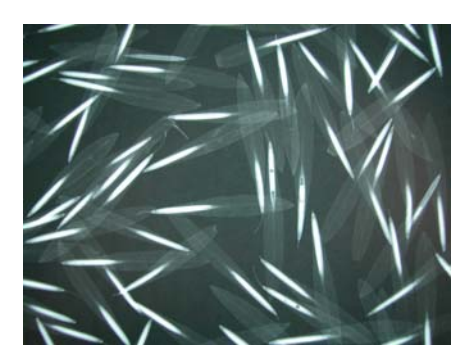
X-ray of filled and insect damaged ash seed Note segmented embryos (arrow) where insects have eaten.