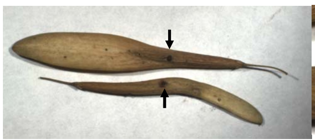
Evidence of insect damage to seed (arrow). Note also deformed seed (bottom).