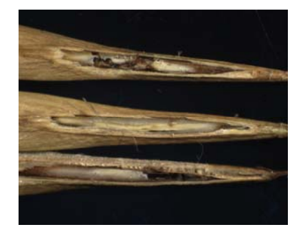
Ash seed sliced longitudinally to examine the embryo. Middle embryo is good while top and bottom have insect damage.