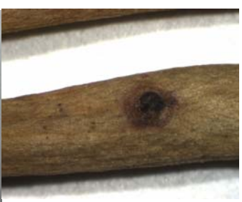
Close up of insect entrance hole in seed.