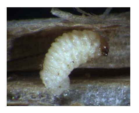
Close up of grub found in ash seed.