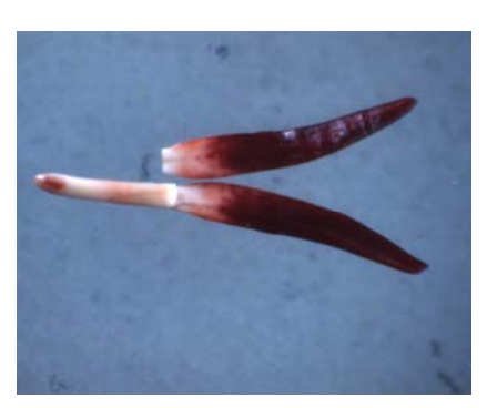
Tetrazolium stained ash embryo. Red color indicates good (live) embryo.