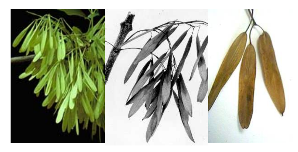
Ash seed clusters.