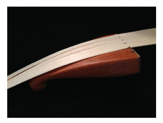
Fig. 7 Gauge for cutting splints