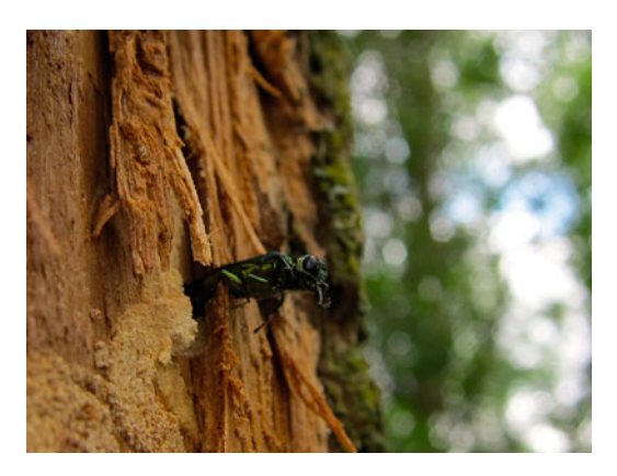
Fig. 5 Emerald Ash Borer emerging from an ash tree