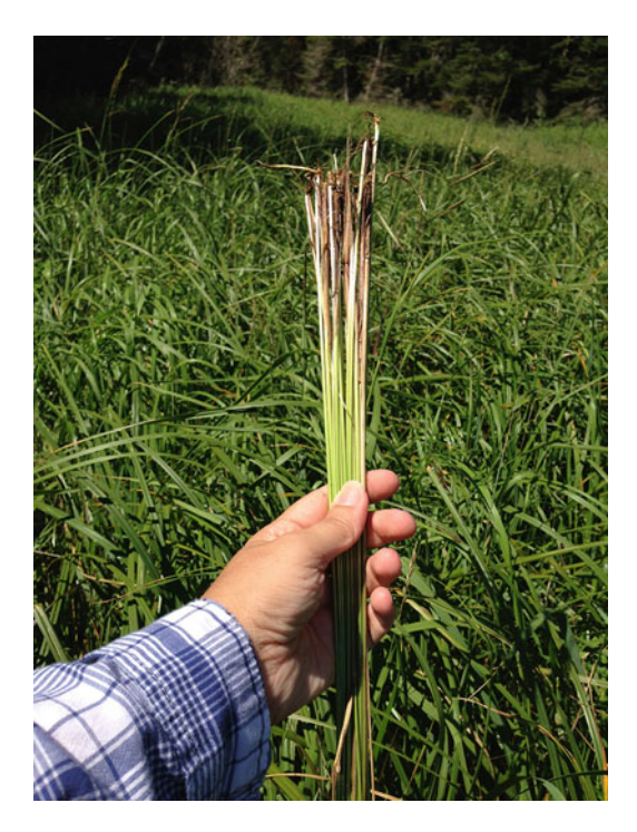
Fig. 8 Picking sweetgrass for weaving

non-Wabanaki people, restrictions on access to their traditional brown ash and sweetgrass harvesting sites, and an invasive species of ash-destroying beetle: the Emerald Ash Borer ( Agrilus planipennis ) (Fig. 5).