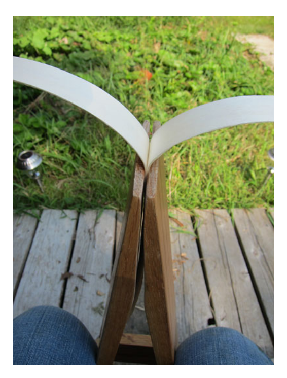
Fig. 6 Splitting black ash splints with a wooden tool known as a splitter