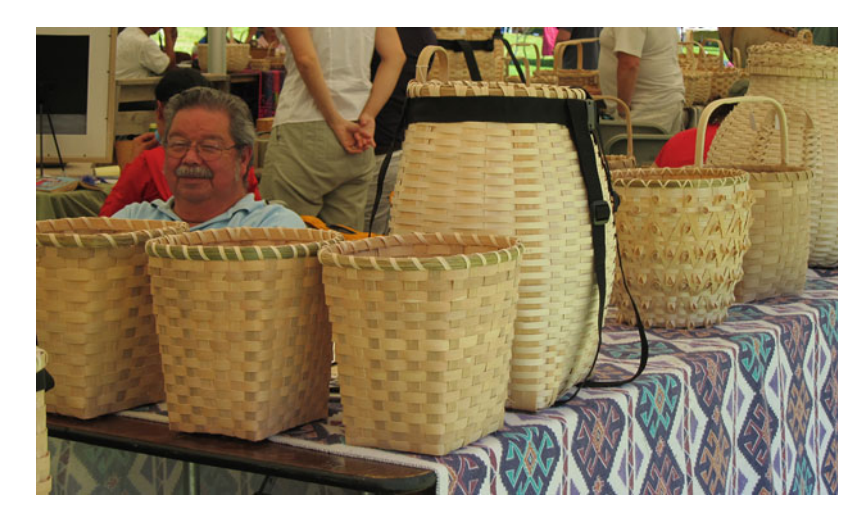
Fig. 9 Utility baskets by Peter Neptune (Passamaquoddy)