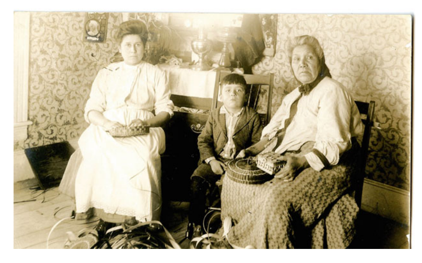
Fig. 4 Penobscot women and boy making baskets in their living room, early twentieth century

the introduction in the 1860s of labor-saving commercial aniline dyes, which allowed for a brighter and more varied basket color pallet (Neptune, 2008b; Whitehead, 2004). By the mid-1880s, new technologies improved the manufacturing of tools like wood splitters, gauges, and blocks for holding a basket's shape, which helped Wabanaki basket makers create even smaller and fancier decorative baskets (Mundell, 2008). For example, Penobscot men who worked at canoe factories in Old Town, Maine, used factory lathes to create new shapes and styles of basket blocks. By the turn of the twentieth century, tribal census data reveal that almost every Passamaquoddy and Penobscot household had at least one member whose primary occupation was basket maker. Making baskets was a communal and intergenerational activity (Figs. 3 and 4). Women would often host sweetgrass braiding parties in their homes, and children could observe the work of adults and sometimes make their own miniature baskets.