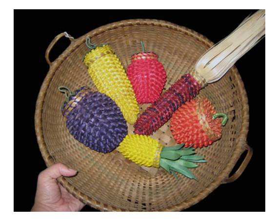
Fig. 10 Fancy baskets by Passamaquoddy weavers Clara Keezer and Theresa Gardner

individual trees based on a set of complex technical criteria for matching individual trees to their basketmaking needs. For example, by notching a small section of the trunk with an axe, a harvester can tell yearly tree ring growth and its suitability for a utility or fancy basket.