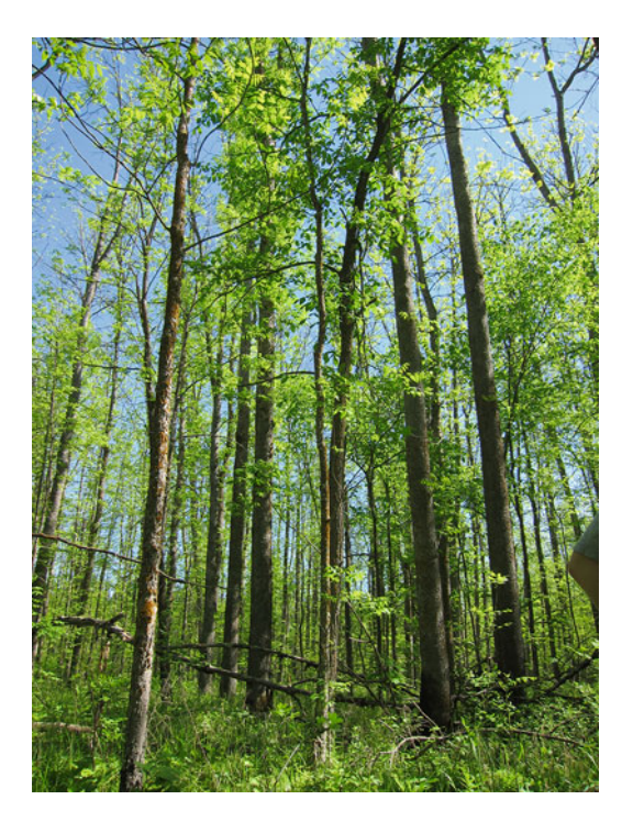
Fig. 2 Black ash trees. They can grow 60–70 f. in height and reach a trunk diameter of 8–24 in., producing a small cluster of branches high off the ground