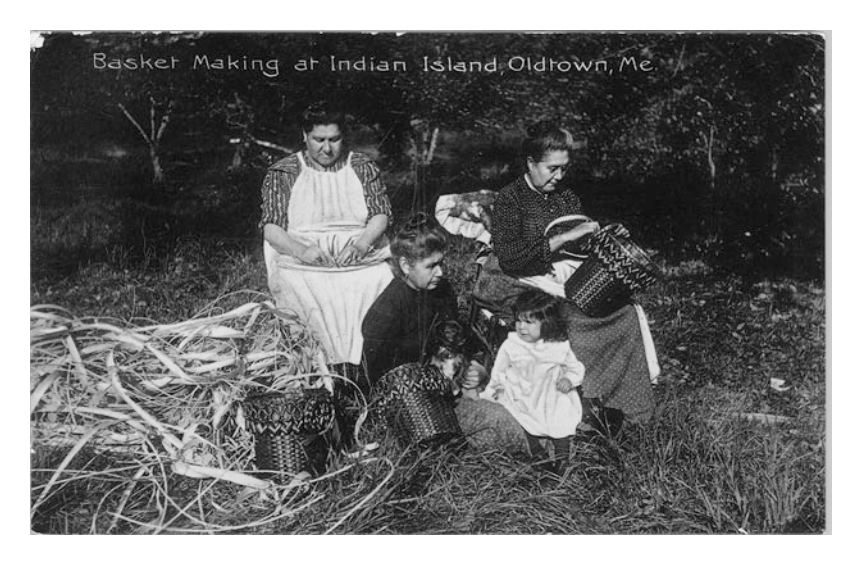
Fig. 3 Penobscot women and girl weaving outdoors on Indian Island, Maine, early twentieth century

museums, and basket makers helped shape a consumer market for Wabanaki baskets (Bourque & Labar, 2009). As non-Native vendors and collectors sought out Wabanaki baskets as consumer goods of artistic value, indigenous basket makers traveled to major cities like Boston, New York, and Philadelphia along the Eastern seaboard to sell their products (Neptune, 2008a). Beginning in the mid-nineteenth century, Wabanaki families set up encampments in well-known resort towns such as Kennebunkport and Bar Harbor on Mt. Desert Island, Maine, to sell their baskets and other crafts to wealthy summer residents and vacationers (McBride & Prins, 2009). New styles of ornamentation and decorative weaves accompanied