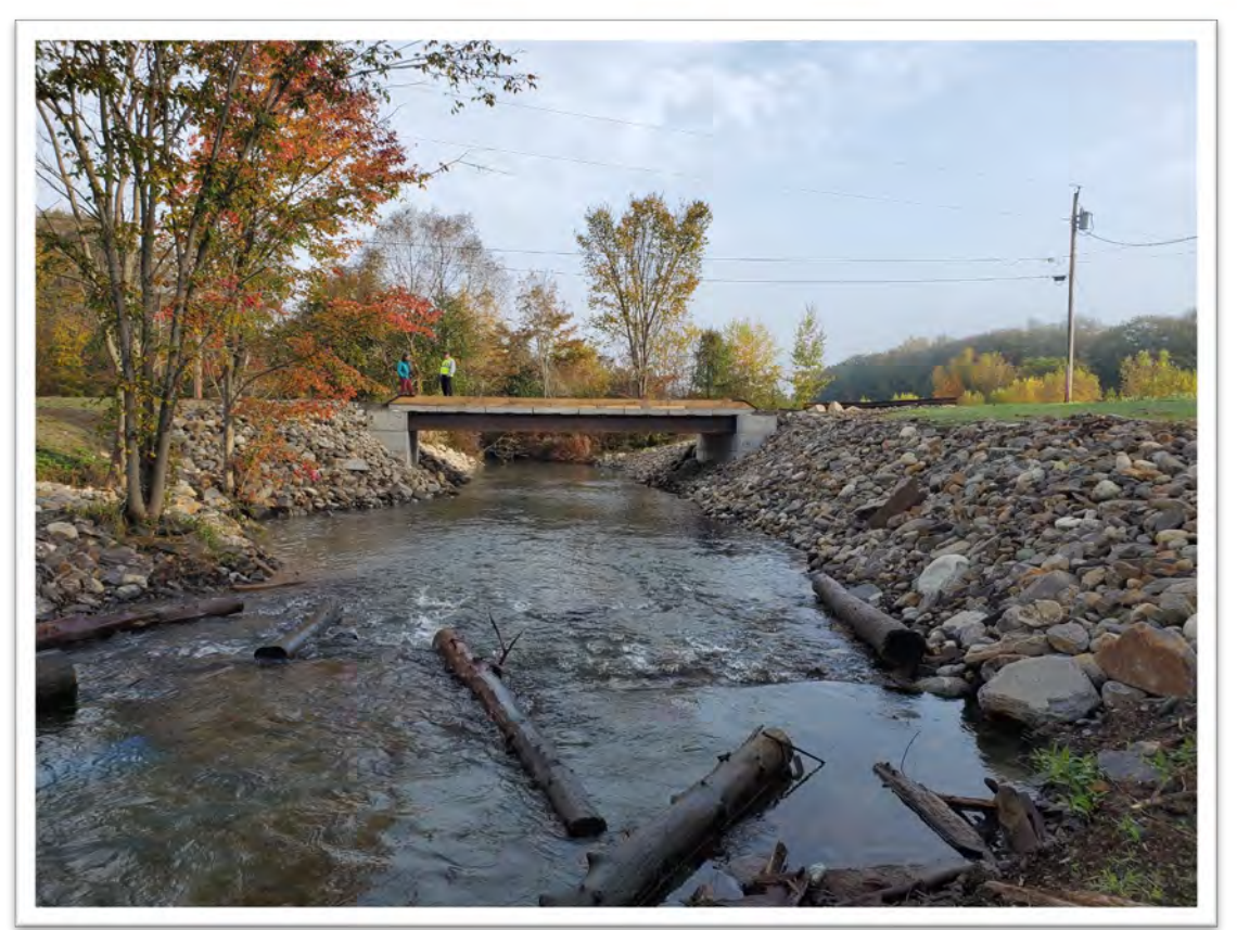
Right: After photo of stream restoration at Site 3.