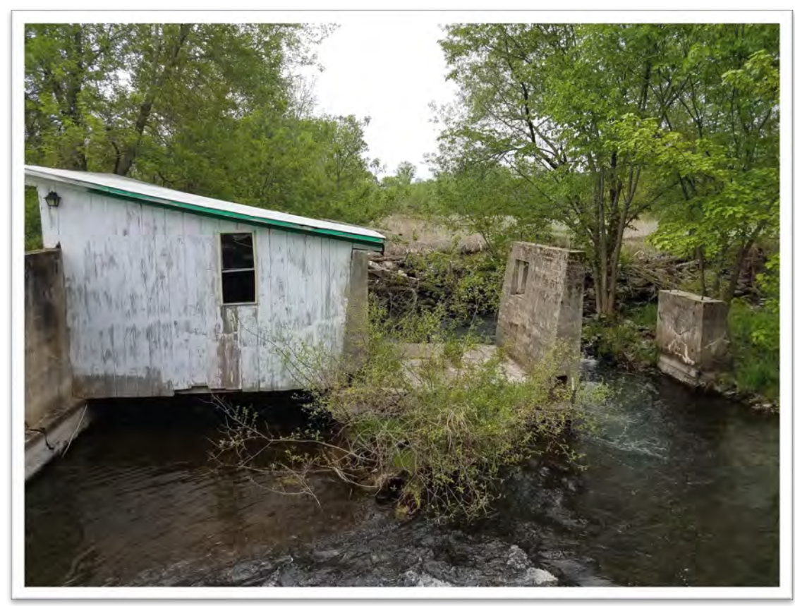
Left: Before photo looking upstream at AOP barriers at Site 3.