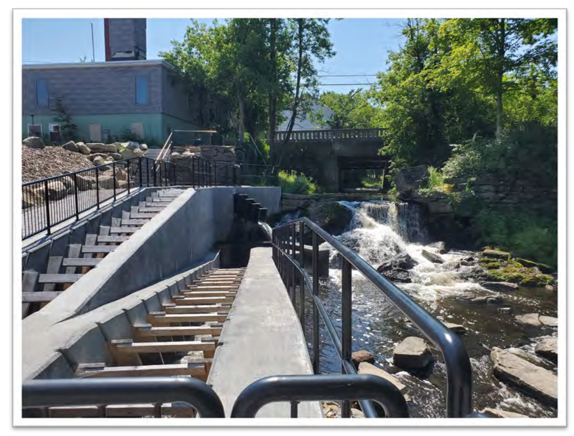
Left: After photo of engineered concrete fish ladder at Site 6.