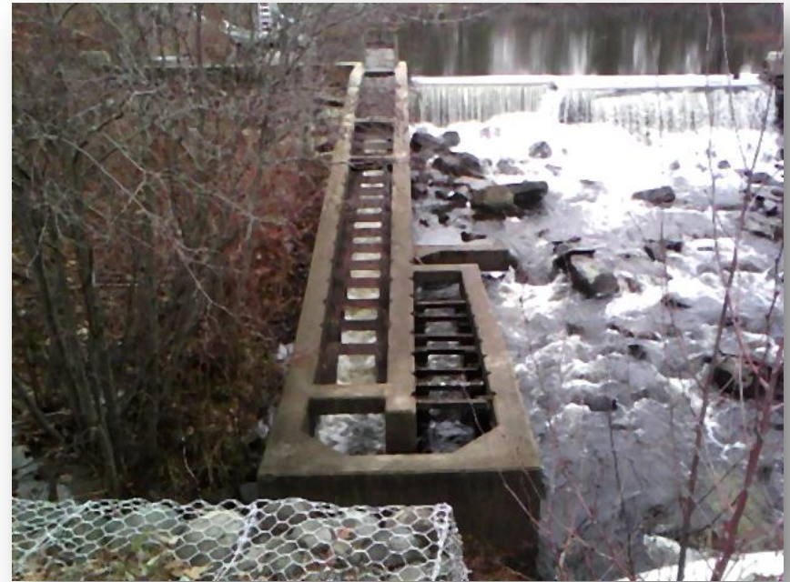
Pitcher Pond Dam in North Port