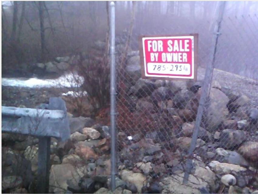
Fish Pond Dam in South Hope