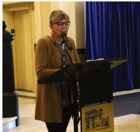
Maine Museums Day 2018

Engaging students in performance with professional instrumentalists serves the educational mission of the university directly, contextualizing the students' work in public presentation.