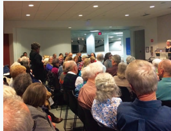
Maine Heritage Lecture 2018