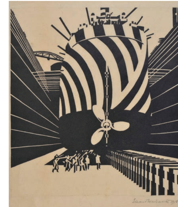
Top image: “Euphony and ‘We are the Dead’: The Legacy of Loss” symposium poster. Bottom: “Drydock” by Edward Wadsworth, 1918.