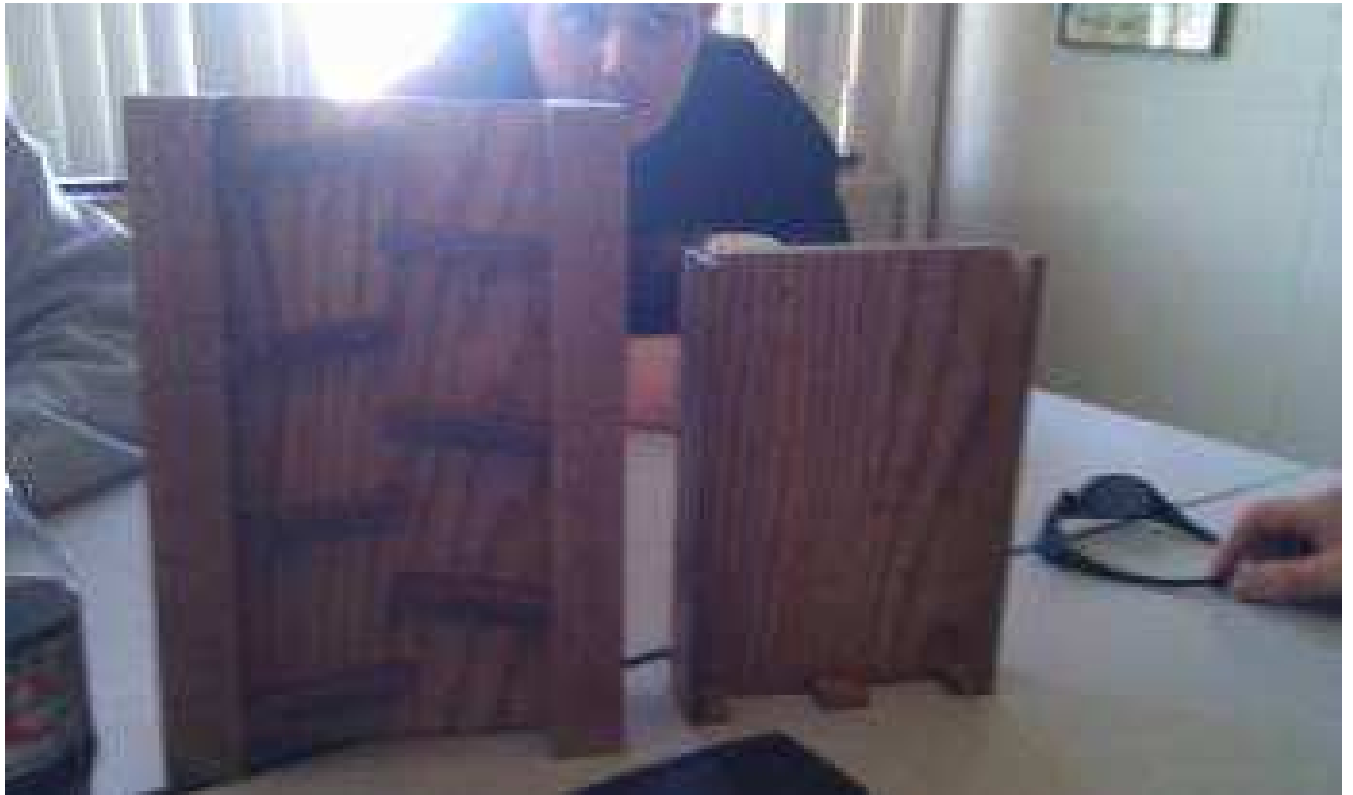
Pegboards in progress