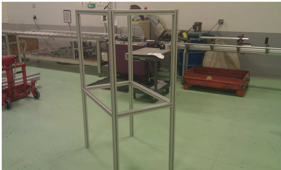
Aluminum frame assembled