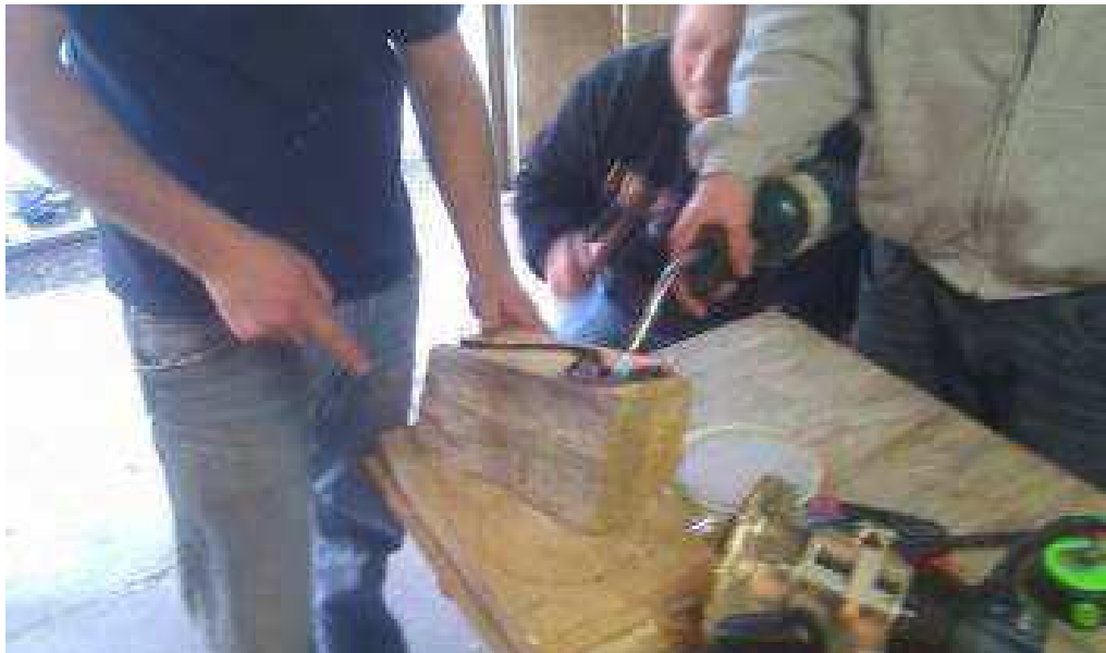
Cutting/burning wooden track