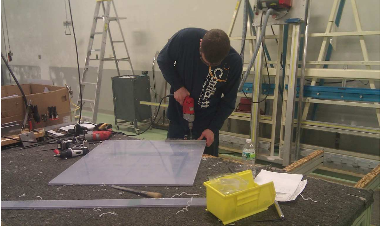
Building the Enclosure at Lanco Assembly Systems