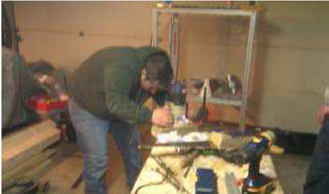
Getting started with assembly