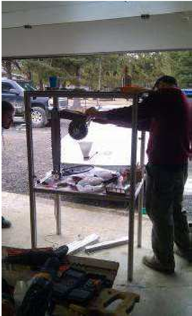
Assembling bar and chain, and human interaction skill saw blade