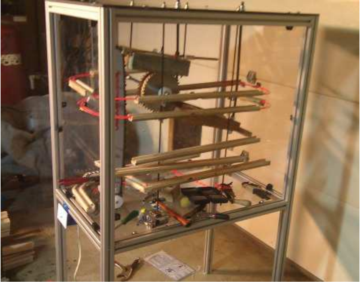
Project almost completely assembled, working except for pickup system