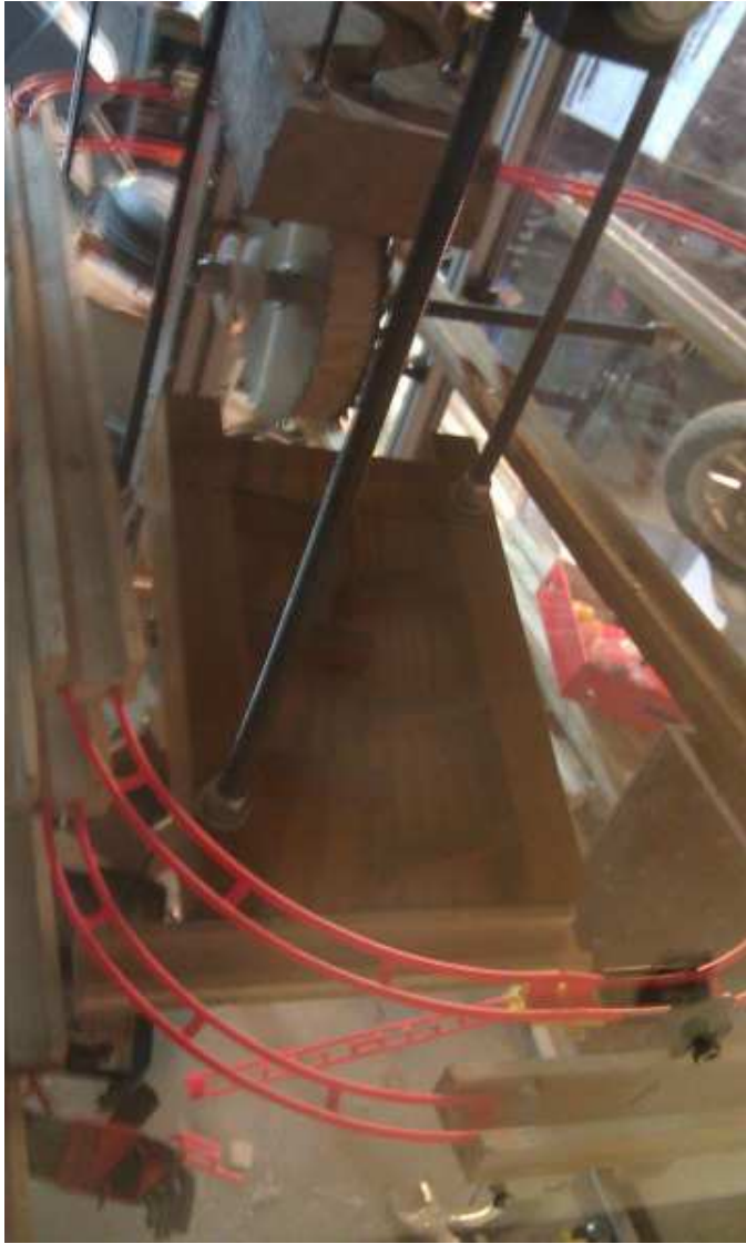
Wooden track and plastic corners