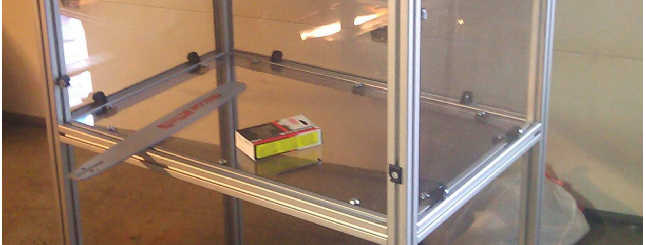
Enclosure and saw blade