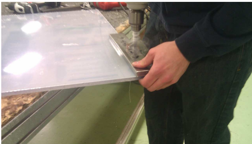
Drilling Mounting holes in Lexan