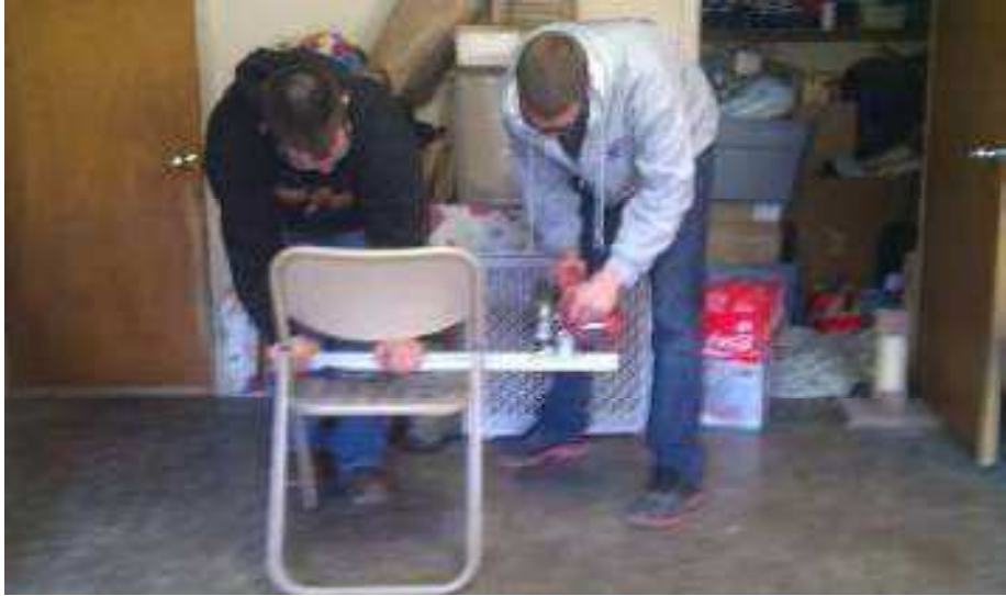
Cutting aluminum for bar supports