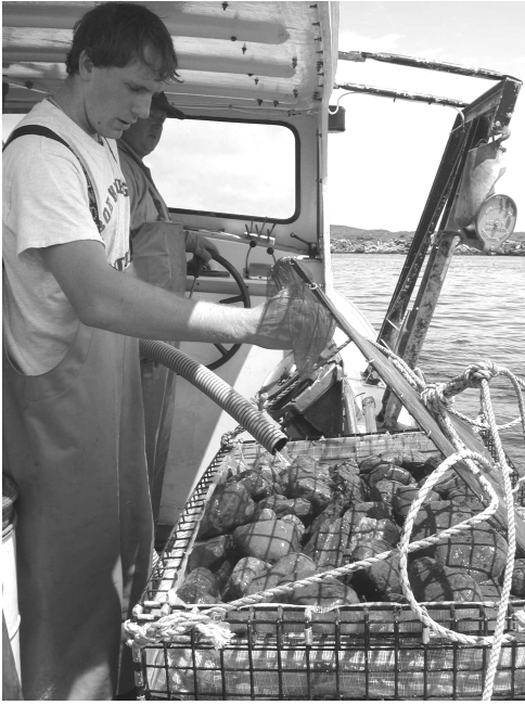
Figure 3. Mimicking nature. Collector on the rail of a lobster boat. This collector was fitted with a fine mesh cover that is being removed after the test to evaluate haul-back losses of postlarval lobsters seeded to the collectors.

together with Boothbay lobsterman, Matt Parkhurst, to develop a design that would lend itself to being deployed with standard commercial trap hauler. The design simply consists of a flat trap-wire mesh tray filled with cobbles and lined with fine screening on the bottom and sides (Fig.3). We did not relish the prospect of lugging scores of hundred-pound trays of rock, nonetheless we heeded Matt's common sense advice: "Make 'em heavy and they'll stay put." The end-result is a design that mimics the natural nursery habitat.