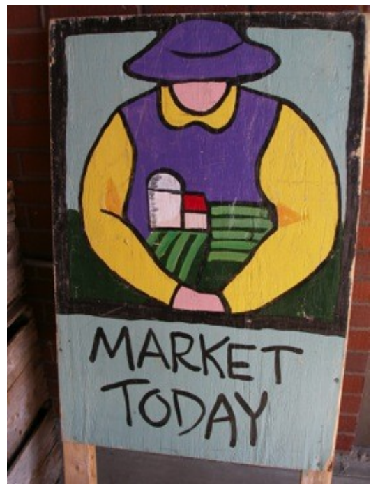
Photo – Skowhegan Farmers Market and Pick Up CSA advertising sign

The research project goal was to develop a set of criteria that would inform local farmers about the unmet market for local foods. An additional goal was to share the beliefs and attitudes of local food entrepreneurs toward local food purchases. The research project clarified what food products were needed. The quality, quantity, and processing specifications and required certifications were also documented. The attitudes and beliefs about local foods both positive and negative as well as the desired local foods were shared with farmers markets and food hub vendors and with the leaders of the Sustainable Food Research Collaborative from the University of Maine working with local food and a food hub in the Bangor area. This information allows farms to plan for new markets currently not being served.