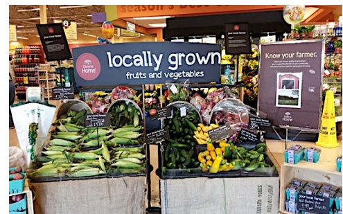
Photo—Local Food Month Display at Hannaford's Supermarket in Skowhegan. August 2015

Local food is not only in demand at farmers' markets, through community-supported agriculture (CSA), and other direct-to-consumer channels; it is also in demand in schools, hospitals, restaurants or any place where food is purchased. In a meeting organized by the Somerset Economic Development Corporation in October 2013, the need to increase the penetration of local foods and to increase sales to high disposable income customers were specifically identified as key needs of the developing local food hub. In this exploratory study, buyer outreach research in the Somerset County region explored local food consumption and expenditures and factors that influenced local food purchase decisions including: desired use of local foods, types of produce and quantities demanded by buyers, and preferred time of year. Other requirements including: quality of product, food safety certification requirements, price, client preference, and consistency were investigated as well. A written report of our findings will be provided to the growers and businesses connected to the Skowhegan Food Hub and the Somerset County Economic Development organization.