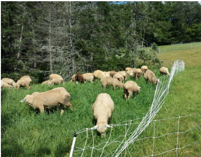
Sheep being moved to new paddock with mixed grasses including fescue.

Endophyte-infected forages consumed by beef cattle and other livestock can cause lameness, poor gains, reduced milk production and abortion. The economic impact on Maine's $142 Million livestock industry could be high. Cattle fed endophyte-infected forages could experience 34% reduction in pregnancy rates, 50% reduction in average daily gains or 50% reduction in milk production.