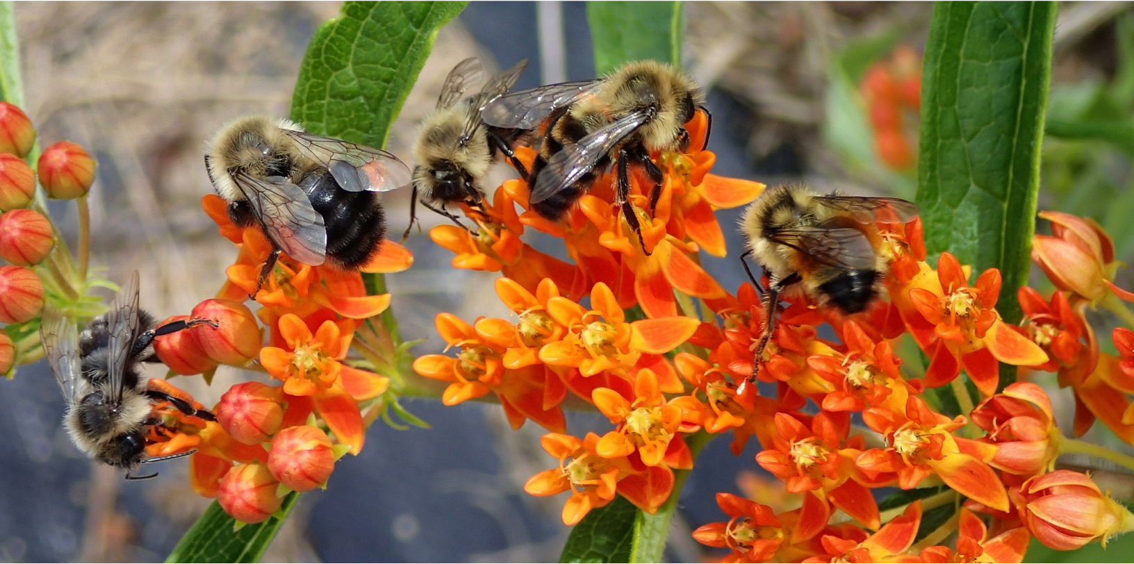
Bumble bees on butterfly milkweed, Asclepias tuberosa , Blue Hill, Maine, July 25, 2013.