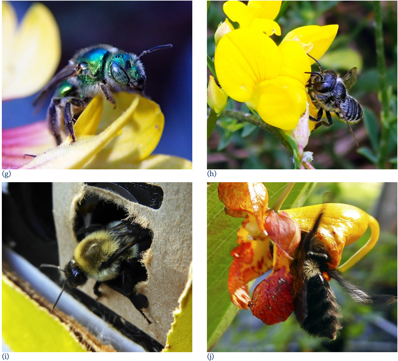
Figure 1. Bees of northern New England. (a) Bombus terricola on white form of Asclepias syriaca , Blue Hill, ME, July 12, 2014; (b) Bombus ternarius queen on Erica tetralix , Brooklin, ME, April 23, 2014; (c) Bombus terricola on Chaemerion angustifolium at Mizpah Hut, Mt. Pierce, White Mountain National Forest, NH, elev. 1158 m, Aug 15, 2012; (d) wool carder bee, Anthidium manicatum , Blue Hill, ME, Sept 19, 2012; (e) Andrena sp. on Salix sp., Brooklin, ME April 21, 2014, (f) Ceratina dupla on Prunus , Hampden, ME, June 23, 2014; (g) Augochlora pura , on Gaillardia sp., Blue Hill, ME, Sept 21, 2015; (h) Megachile sp., on Lotus corniculatus , Crampton, NH, Aug 18, 2013; (i) Bombus impatiens emerging from a commercial quad, Orono, ME, Sep 30, 2016 (Megan Leach photo); (j) Bombus impatiens visiting a flower of Impatiens capensis (Megan Leach photo). (Photos by A. C. Dibble unless attributed otherwise.)