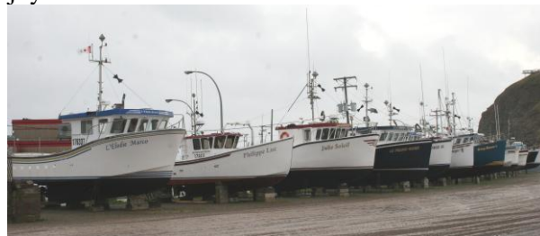
Lobster Boats at Gaspé, Quebec, Canada

Over 60 of Seabourn's guest participated in Lobster College, earning their "diploma" as part of the inaugural Seabourn Lobster College Class of 2013. Classes were also video-taped and broadcasts on the ship's onboard television channel for other guests to enjoy and learn