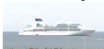
Seabourn Sojourn anchored in Nova Scotia

Note to our Canadian friends: Don't forget to get your passport applications in ASAP!