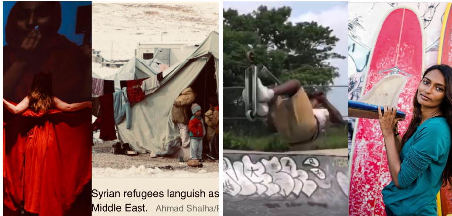
Syrian refugees languish as Middle East.