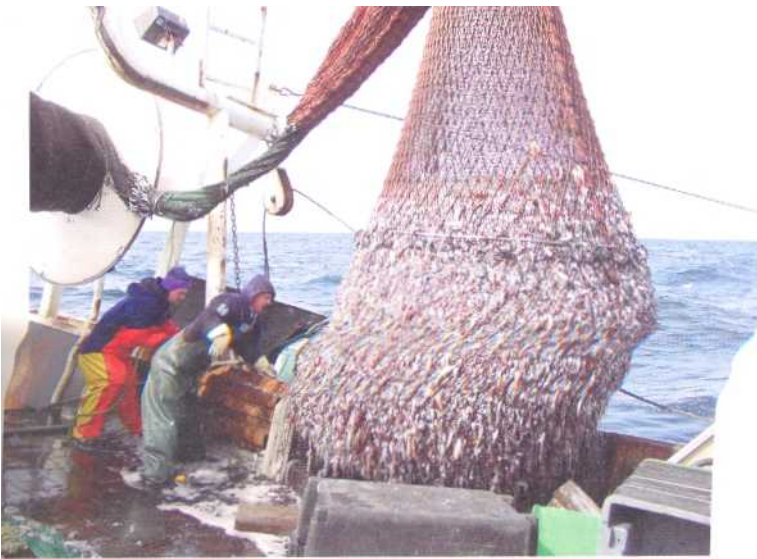
Photo 2. Rutgers University and National Fisheries Institute conduct collaborative gear selectivity research to reduce discards of scup Stenotomus chrysops in the longfin inshore squid Loligo fishery

In addition, gear studies have a long history and really cannot be done without industry boats. Examples of older industry-science collaborative gear studies include the Nordmore grate in the shrimp fishery and various studies to reduce the take of marine mammals. Many of the "collaborative" studies in the past did not fully involve fishermen in all phases of the research program, treating them mainly as owners and operators of "for-hire" vessels. Gear scientists doing collaborative research today emphasize