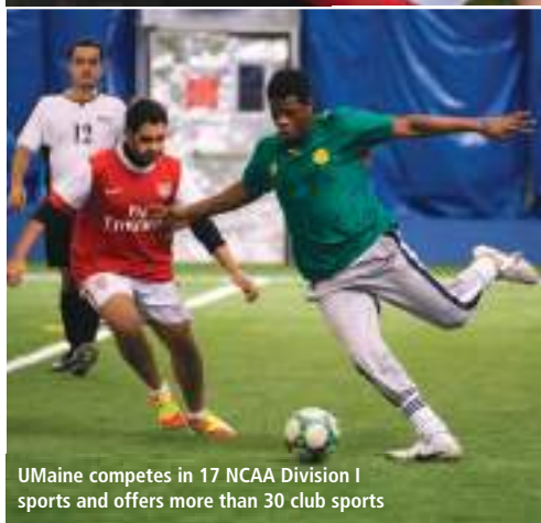
UMaine competes in 17 NCAA Division I sports and offers more than 30 club sports