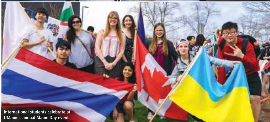
International students celebrate at UMaine's annual Maine Day event