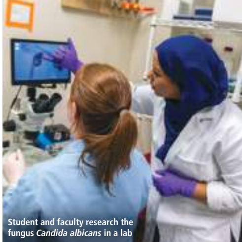
Student and faculty research the fungus Candida albicans in a lab