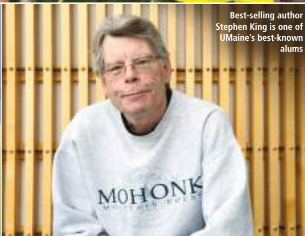
Best-selling author Stephen King is one of UMaine's best-known alums

UMaine is located in Orono , a classic college town just 8 kilometers from the city of Bangor (population 33,000), with more than 200 retail shops and restaurants.