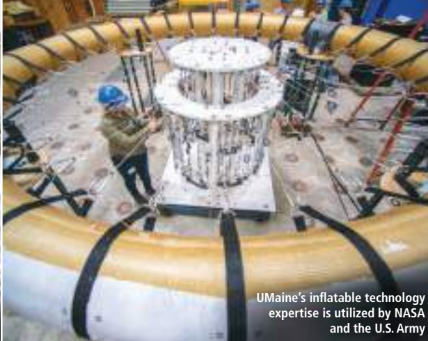
UMaine's inflatable technology expertise is utilized by NASA and the U.S. Army