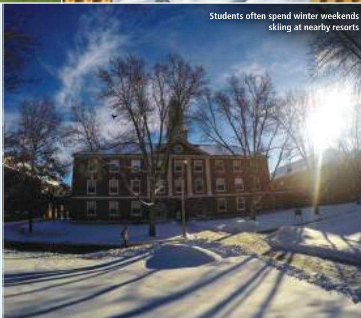
Students often spend winter weekends skiing at nearby resorts