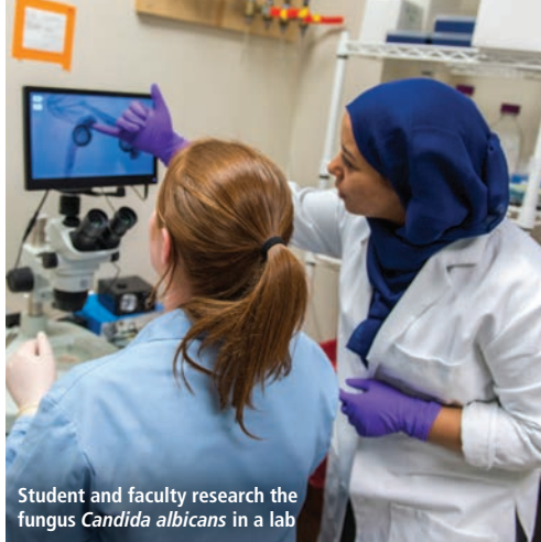
Student and faculty research the fungus Candida albicans in a lab