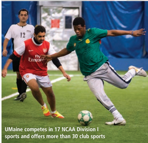
UMaine competes in 17 NCAA Division I sports and offers more than 30 club sports