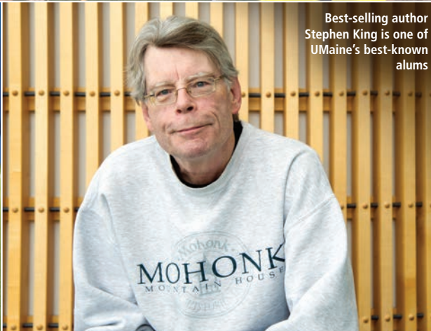
Best-selling author Stephen King is one of UMaine's best-known alums

UMaine is located in Orono , a classic college town just 8 kilometers from the city of Bangor (population 33,000), with more than 200 retail shops and restaurants.