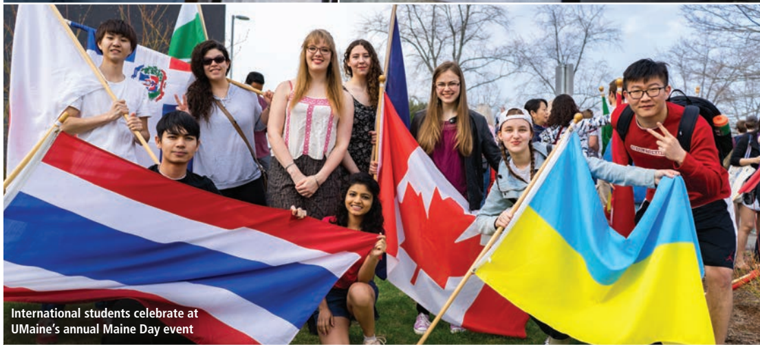
International students celebrate at UMaine's annual Maine Day event