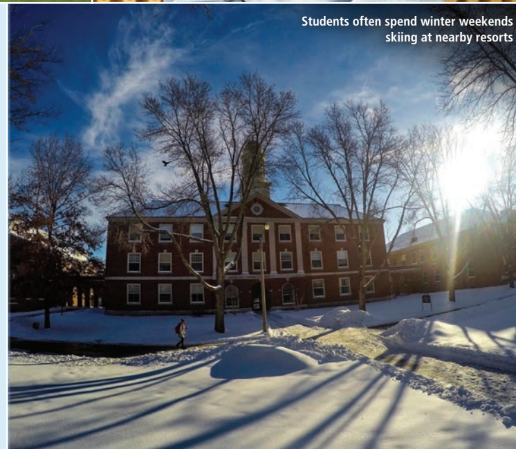
Students often spend winter weekends skiing at nearby resorts