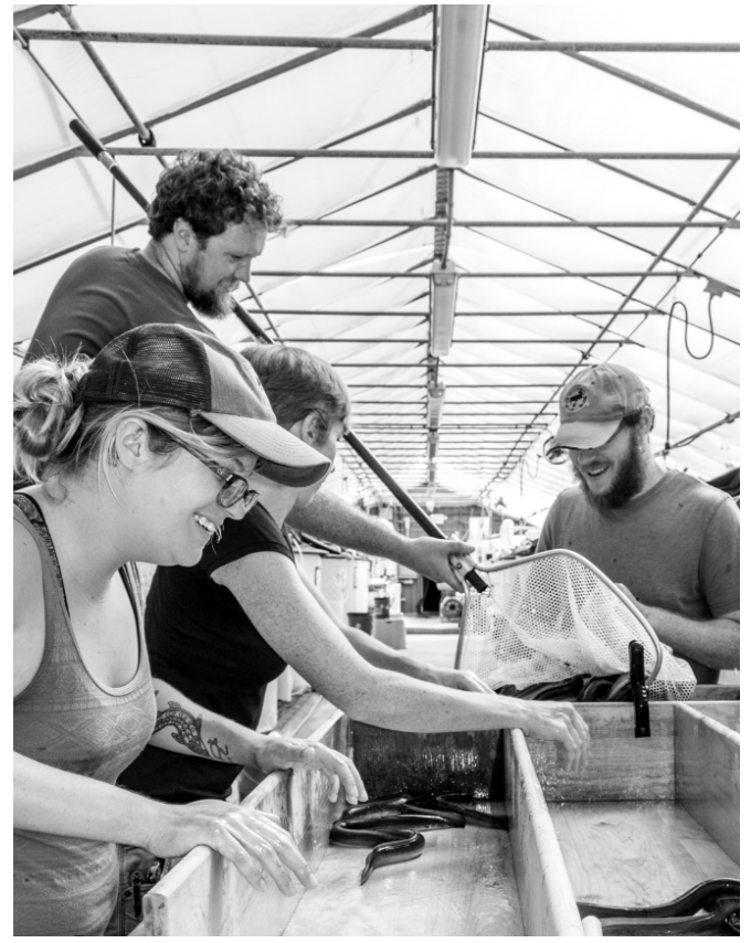
American Unagi eel grading at CCAR

The Center for Cooperative Aquaculture Research (CCAR) was founded as an aquaculture research and development facility to address industry needs at industry scale. Located on Taunton Bay in Franklin, Maine, CCAR's extensive facilities include marine hatcheries, where juvenile fish, invertebrates, and sea vegetables are propagated for research and industry. The center also serves as an aquaculture business incubator, where entrepreneurs can get help with their business plans, find a site for their operations, secure investment capital, engage in research and development, design full-scale commercial aquaculture farms, and utilize our hatchery services. CCAR is a resource for new and established companies, students and faculty, as well as fishermen trying to rebuild natural stocks.