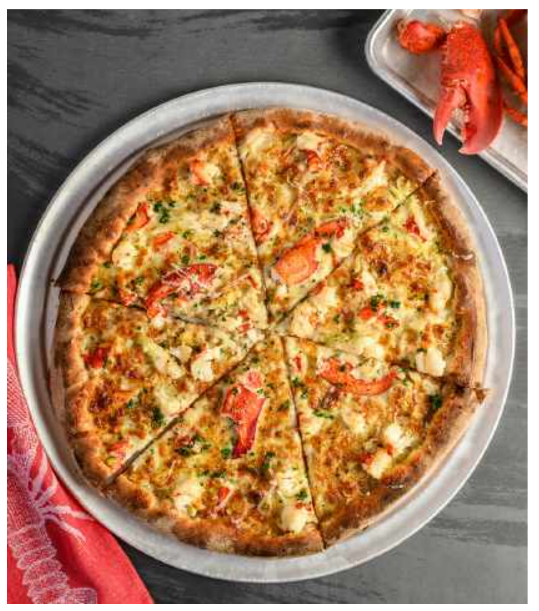
Good Crust's lobster pizza