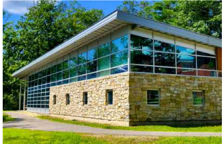
Outside view of the Foster Center for Innovation