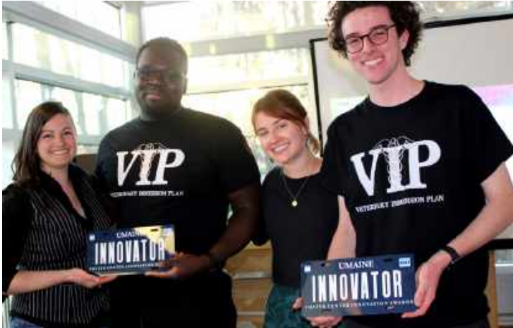
VIP wins 2023 Innovation Award