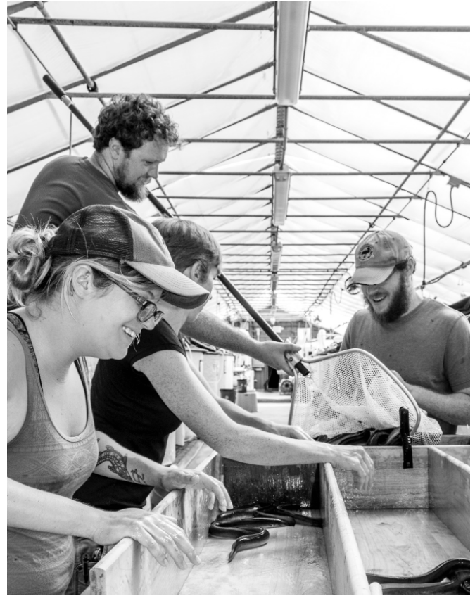
American Unagi eel grading at CCAR

The Center for Cooperative Aquaculture Research (CCAR) was founded as an aquaculture research and development facility to address industry needs at industry scale. Located on Taunton Bay in Franklin, Maine, CCAR's extensive facilities include marine hatcheries, where juvenile fish, invertebrates, and sea vegetables are propagated for research and industry. The center also serves as an aquaculture business incubator, where entrepreneurs can get help with their business plans, find a site for their operations, secure investment capital, engage in research and development, design full-scale commercial aquaculture farms, and utilize our hatchery services. CCAR is a resource for new and established companies, students and faculty, as well as fishermen trying to rebuild natural stocks.