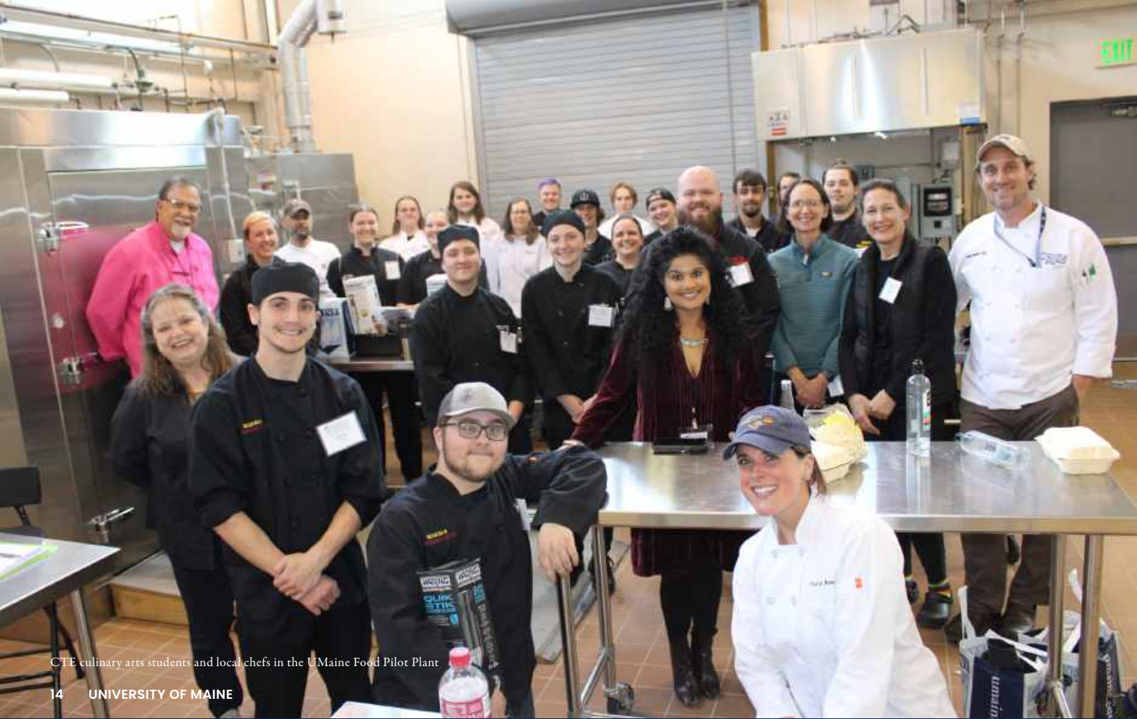
CTE culinary arts students and local chefs in the UMaine Food Pilot Plant