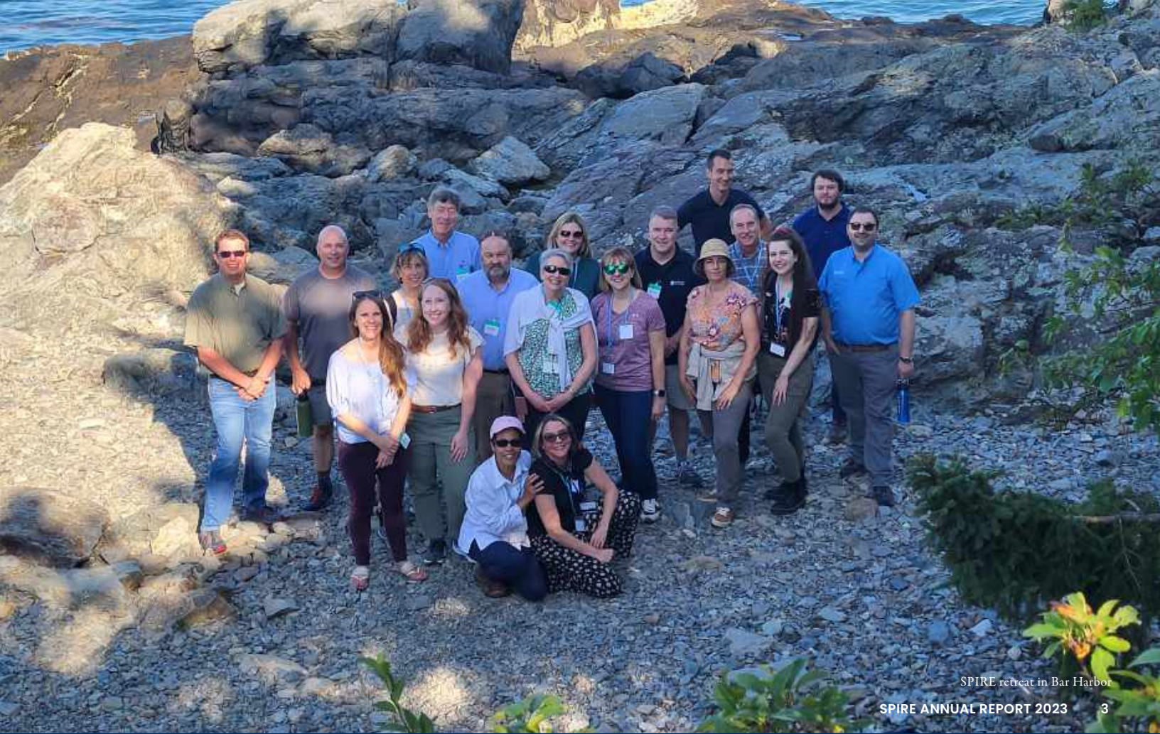
SPIRE retreat in Bar Harbor