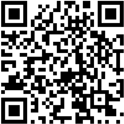
Text Alerts Sign-Up

To call for updates 581-SNOW or register on your browser to sign up for text alerts by following the QR code on the left: