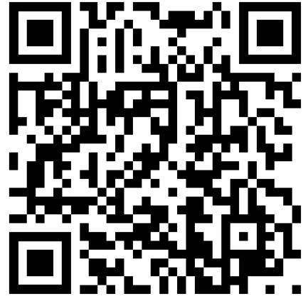
International Student Association