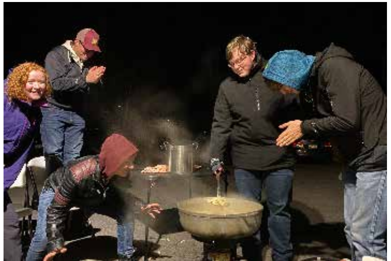
Students cooking french fries for poutines. Wilson Center Thursday Dinner.