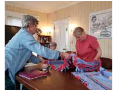
In November 2022 our ladies group made and donated blankets to the Homeless Shelter in Bangor. And we attended the Feztival of Trees at the Anah Shrine Temple in Bangor.