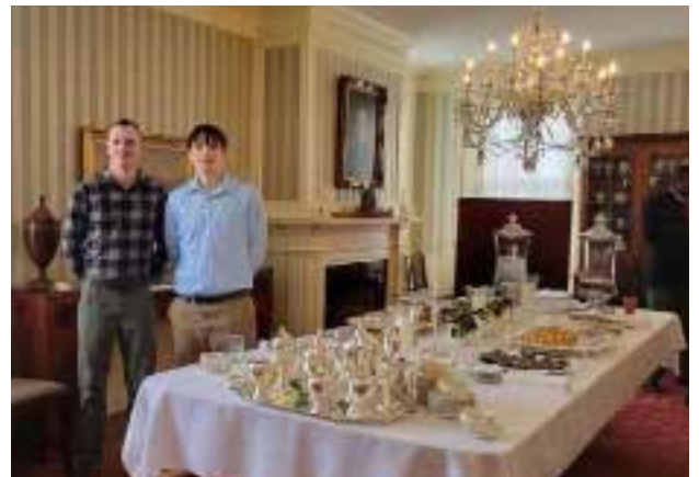
(See more FAROG on page 4)