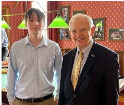
Francophone Day/Culture at the State House