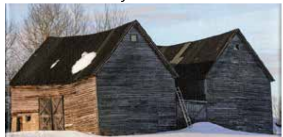
Double barns, Fort Kent, ca. 2010