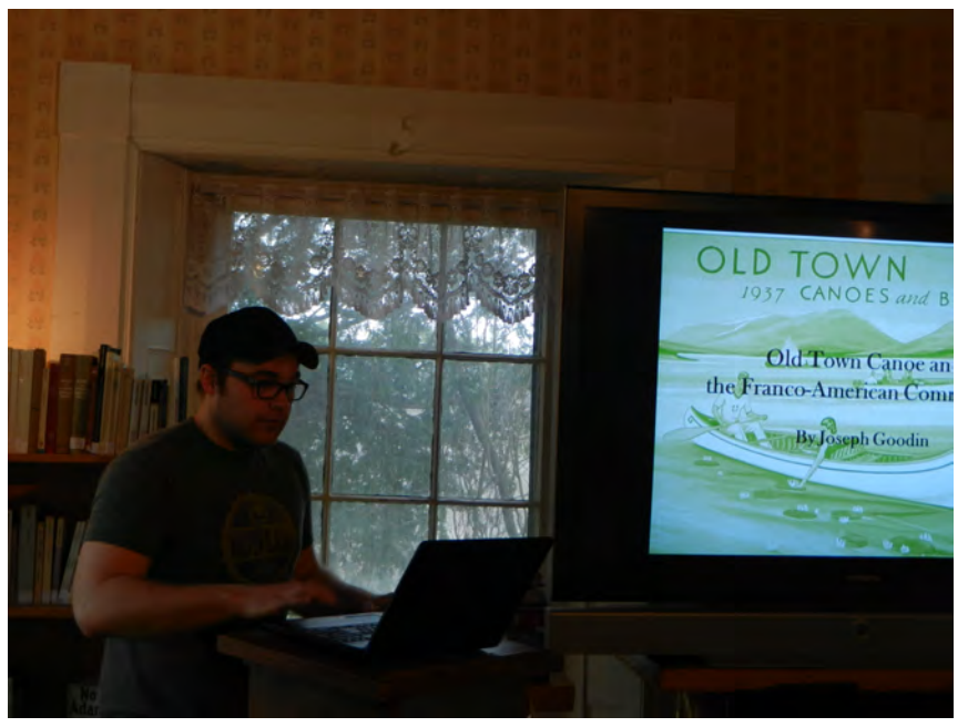
Students giving their final presentations in FAS 120: People, Places, Pasts

Franco American Studies is an interdisciplinary program that explores the French cultures of the United States. Its emphasis is on the people of Franco American heritage in Maine and the Northeast region but it recognizes that cultural patterns do not stop at national borders. We offer several classes at the University of Maine, most of which are taught in English. This semester, we offered a course called, "FAS 120: People, Places, and Pasts." We looked at which places hold meaning for Franco Americans, and we thought about how these physical and geographical spaces map onto psychic and historical ones, giving Franco Americans a sense of belonging, dislocation, or exile. Final projects included looking at which places are represented in Franco American folk music, how Franco Americans inhabited work spaces, the specificity of Franco American homes, impacts of de-industrialization on communities and various projects on specific towns and places.