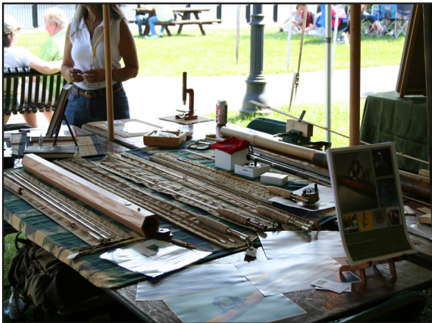
Ardea bamboo rods.