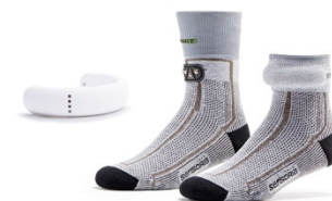
Fig C.2-Smart socks

sphincter applications to correct incontinence. Similarly, giant magneto resistive materials may solve some specific problems in connection with frailty monitoring of older people. The additional potential smart materials and wearables we will be investigating are dielectric elastomers, shape memory materials (SMMs), magnetorheological fluids, Graphene, Ionic Polymer Metal Nano Composites (IPMCs) and carbon nanotube. Particularly in connection with shape memory alloys (SMAs) there are good possibilities of improving the quality of life and health of the elderly by correcting scoliosis (abnormality of spine) and aging-related applications and wearables. Fig. C.4 depicts smart wearable mobility supports equipped with SMMs for the elderly.