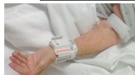
Fig C.3-Wearable Arm Device

D. Priority: indicate how this research would address NSF and state priorities in advancing the frontiers of knowledge and understanding (within a field and/or across different fields).