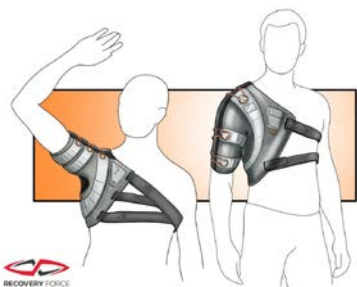
Fig C.4-Smart Wearables

sphincter applications to correct incontinence. Similarly, giant magneto resistive materials may solve some specific problems in connection with frailty monitoring of older people. The additional potential smart materials and wearables we will be investigating are dielectric elastomers, shape memory materials (SMMs), magnetorheological fluids, Graphene, Ionic Polymer Metal Nano Composites (IPMCs) and carbon nanotube. Particularly in connection with shape memory alloys (SMAs) there are good possibilities of improving the quality of life and health of the elderly by correcting scoliosis (abnormality of spine) and aging-related applications and wearables. Fig. C.4 depicts smart wearable mobility supports equipped with SMMs for the elderly.