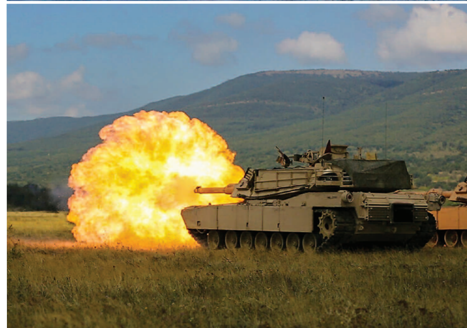
Top Photo: "Missile Cruiser Mobile Bay (CG-53)" by Derell Licht is licensed under CC BY-ND 2.0 Bottom Photo: "USMC M1A1 Tank" by D'oh Boy is licensed under CC BY 2.0