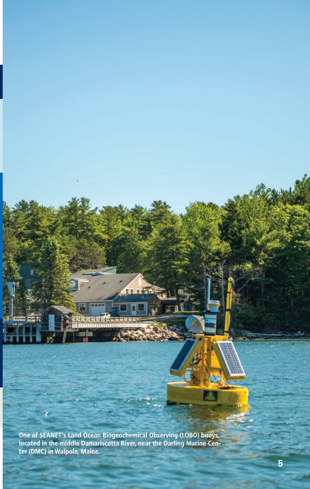
One of SEANET's Land Ocean Biogeochemical Observing (LOBO) buoys, located in the middle Damariscotta River, near the Darling Marine Center (DMC) in Walpole, Maine.

1,091 women and girls involved with STEM