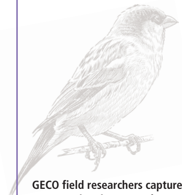
GECO field researchers capture the sparrows in mist nets, take biological samples, and observe the individuals before releasing them.