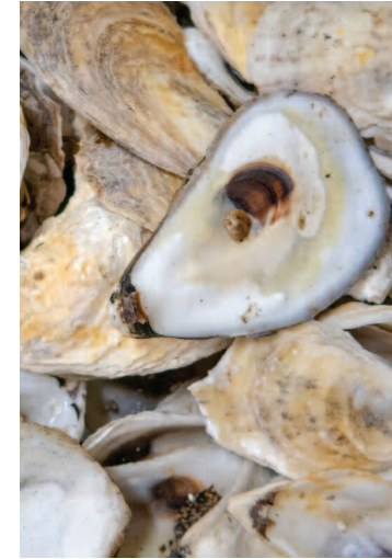
SEANET's research and collaborations have had lasting industrial impacts, and will continue to inform best practices in finfish, shellfish (such as the oysters pictured here), and sea-vegetable aquaculture.