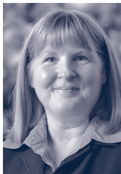
Professor of Family Relations and Human Sexuality