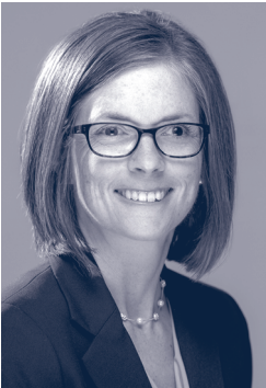
Lecturer in Mathematics