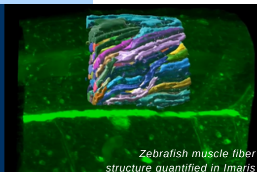
Zebrafish muscle fiber structure quantified in Imaris