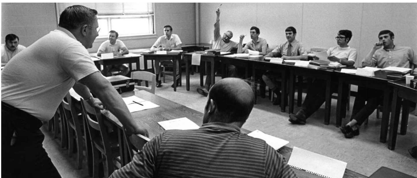
UMaine celebrates its 150th anniversary in 2015. This photo is of a business class from Sept. 15, 1970.