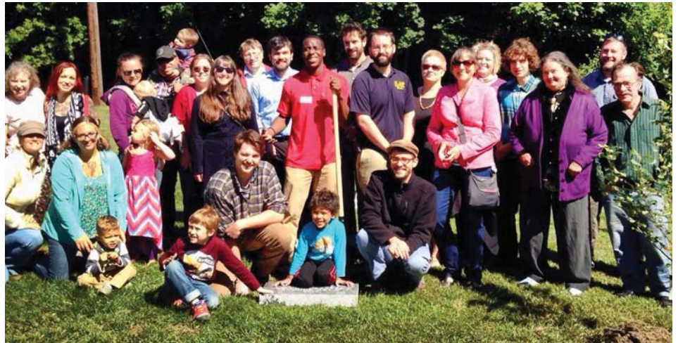
Above: Participants from the groundbreaking of Bangor's first edible park.

Presently the garden contains beds of corn and peppers as well as two apple trees donated by Sprague's Nursery in Bangor planted during a