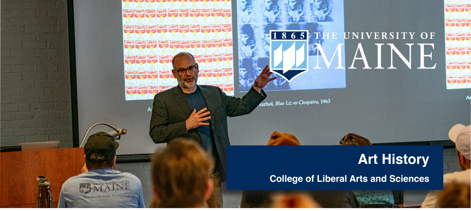
The Art History major prepares students to contribute critically to historical and emerging visual cultures.