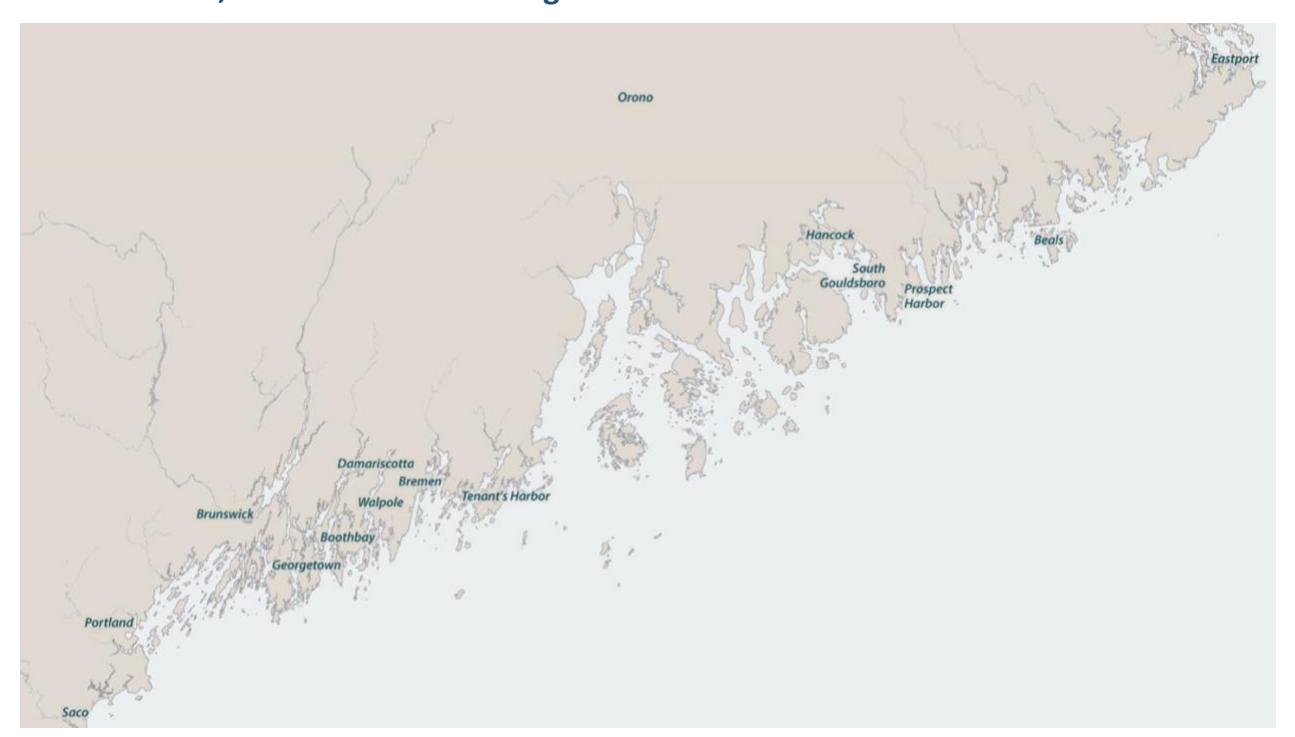
This map highlights Maine towns that 17 projects that Alliance funding benefited. Projects, locations, and descriptions follow.

Cape Seafood, LLC—Saco $150,000 (matched $182,000) for lobster processing equipment and development of two new products.