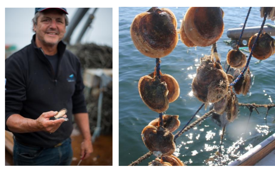
The Alliance is enabling new technologies, like submersible mussel rafts and growing scallops using Japanese ear-hanging methods, that boost Maine's aquaculture industry.

With its diversity of industry, educational institutions and nonprofit members, the Alliance is positioned to take advantage of the significant growth potential in Maine's seafood industry. With a $14-plus million initiative ($7 million in public funds, administered by Maine Technology Institute, plus more than $7 million in initial private investments), the Alliance is committed to ensuring the success of Maine's seafood industry, including sustaining and growing jobs.