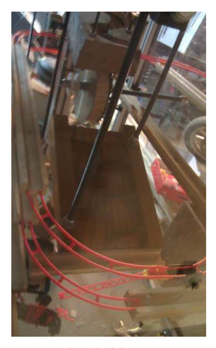
Wooden track and plastic corners