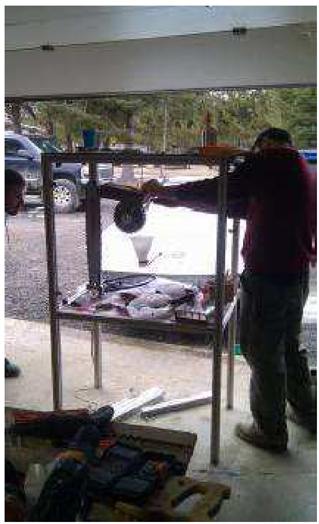
Assembling bar and chain, and human interaction skill saw blade