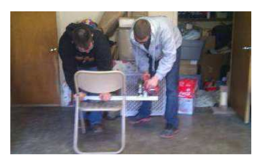
Cutting aluminum for bar supports