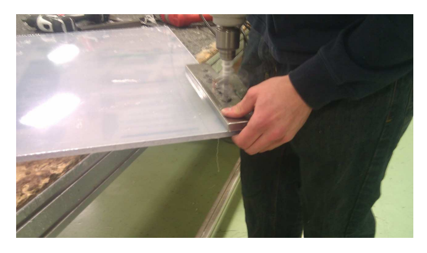
Drilling Mounting holes in Lexan