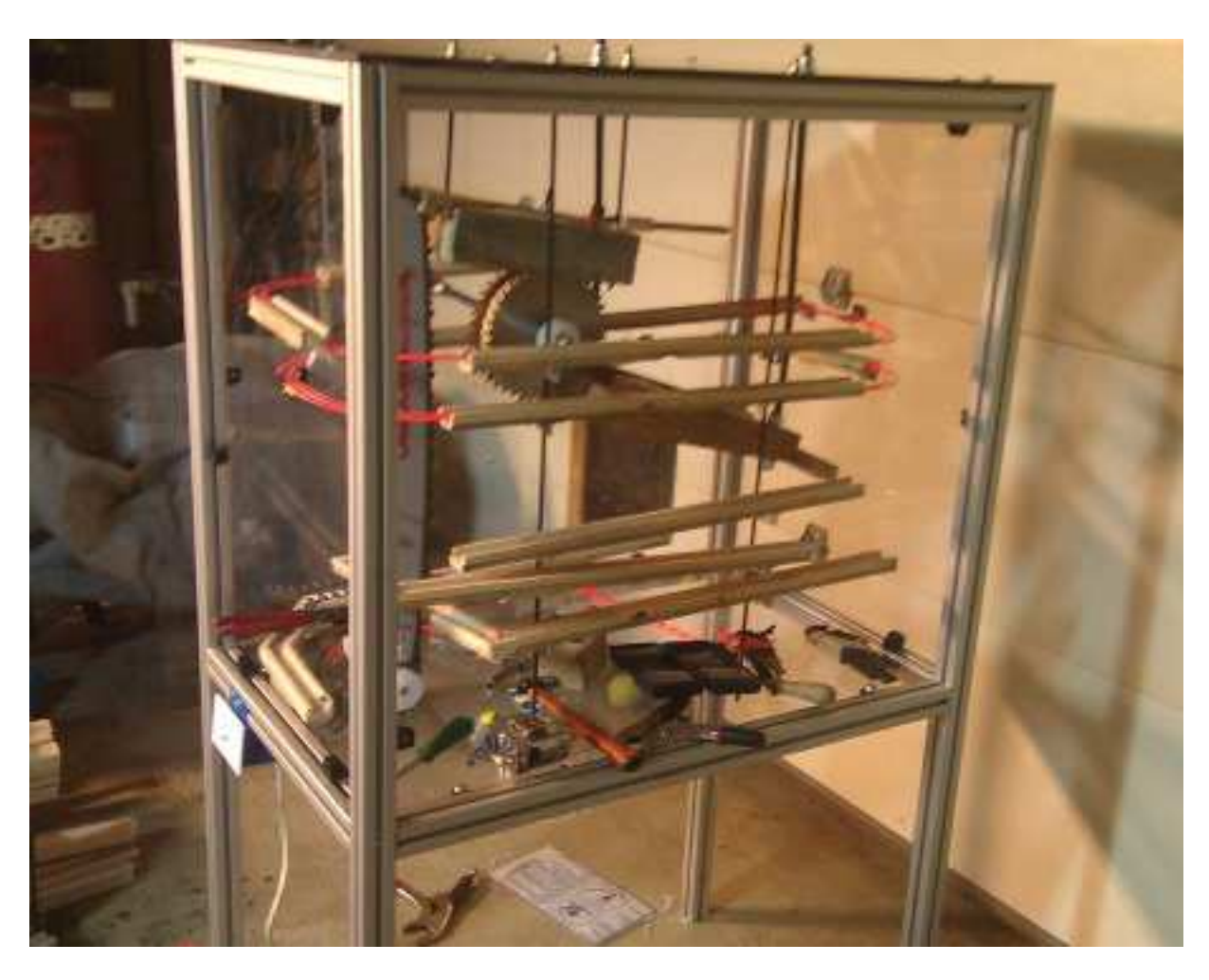
Project almost completely assembled, working except for pickup system