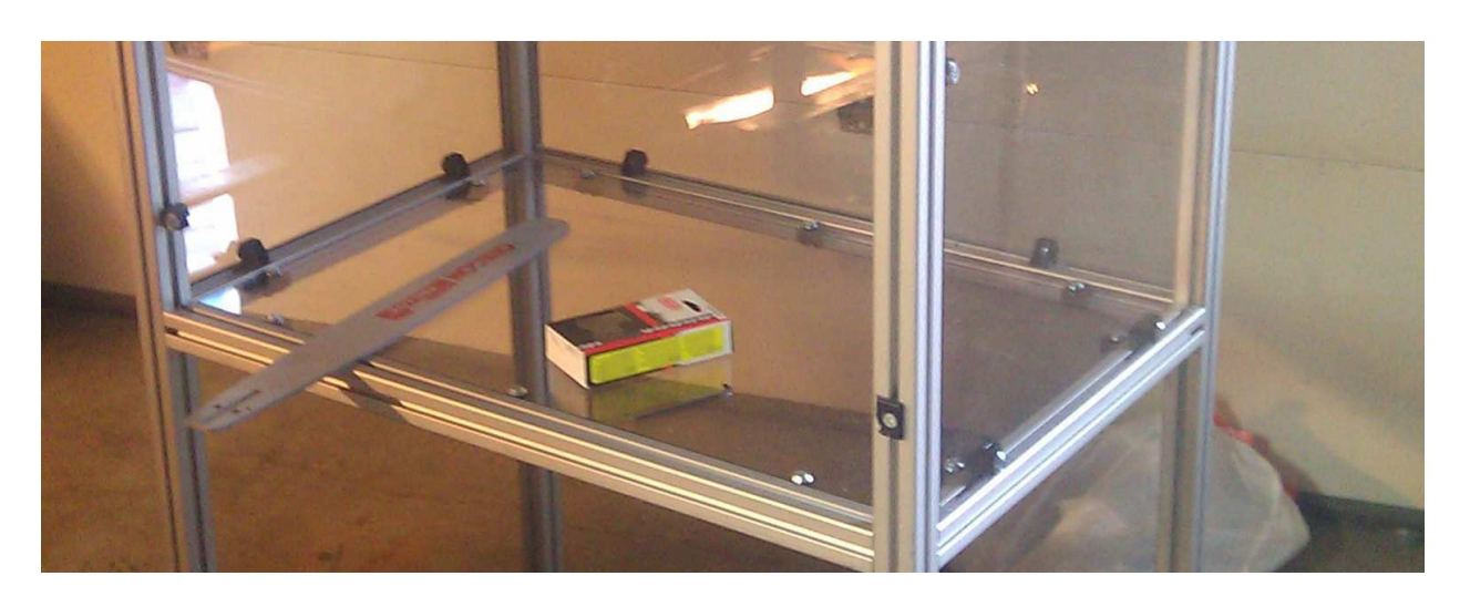
Enclosure and saw blade