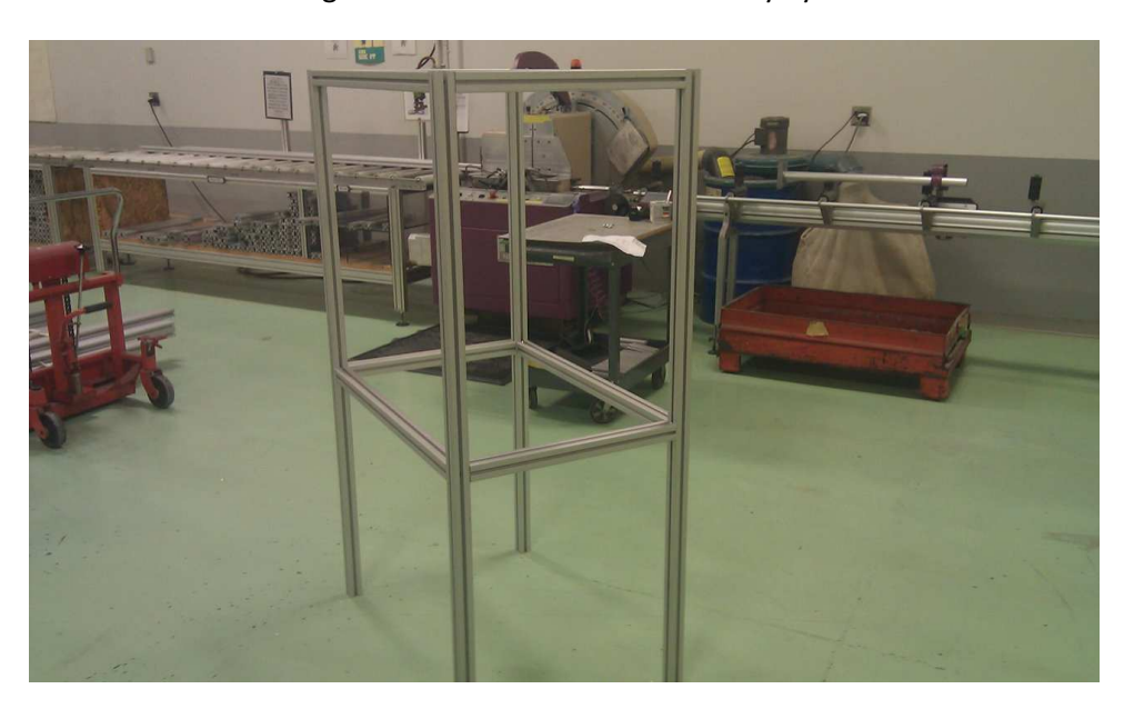
Aluminum frame assembled