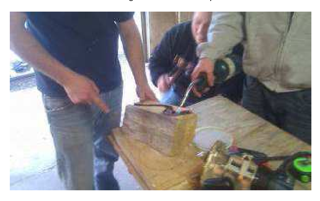
Cutting/burning wooden track