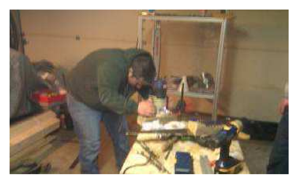
Getting started with assembly