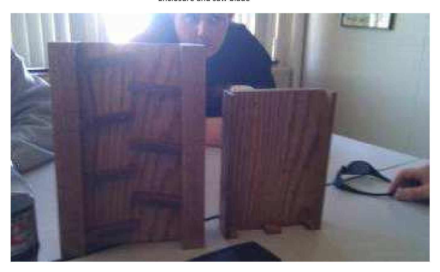
Pegboards in progress