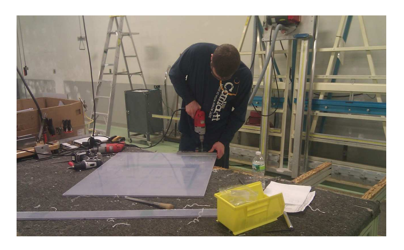
Building the Enclosure at Lanco Assembly Systems