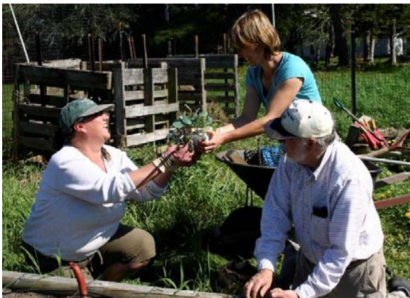
Woodlawn Demonstration Garden, Ellsworth

Master Gardener Volunteers help local gardeners design and establish community gardens. They help gardeners in senior apartment complexes and nursing homes grow and maintain flowers and vegetables. They help community gardeners grow organic vegetables and flowers for community use, local food banks, and homeless shelters.