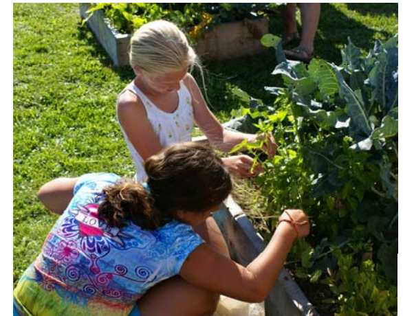
Kids Can Grow, throughout Hancock County

As a commitment to the community of Ellsworth, Master Gardener Volunteers prepare the natural habitats and boardwalk for the spring and winter seasons.