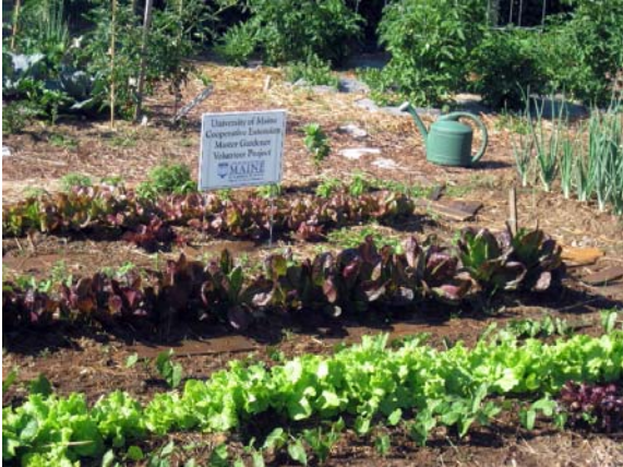
Hancock Community Garden, Hancock

Master Gardener Volunteers help local gardeners design and establish community gardens. They help gardeners in senior apartment complexes and nursing homes grow and maintain flowers and vegetables. They help community gardeners grow organic vegetables and flowers for community use, local food banks, and homeless shelters.