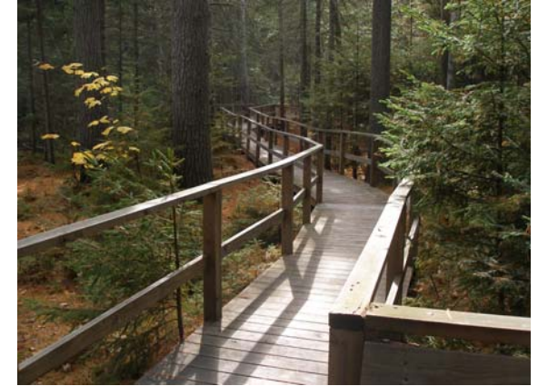
Birdsacre Woodland Gardens, Ellsworth

As a commitment to the community of Ellsworth, Master Gardener Volunteers prepare the natural habitats and boardwalk for the spring and winter seasons.