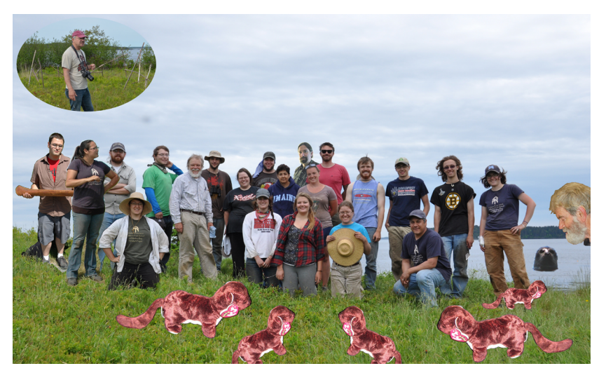
Field school students in Machias, with the addition of guest excavators and speakers (by photoshop). This was the year of the Sea Mink, to explain the stuffed four-footed guests.

his year we conducted three different archaeology programs spanning nearly eight weeks. The MAPI (Maine Academic Prominence Initiative) field school (ANT 477) ran for four weeks in June. Working with the Passamaquoddy Petroglyph Project, we continued work on a Late Woodland shell midden site in Machias Bay. We had a good year finding important animal bone remains that relate to subsistence,